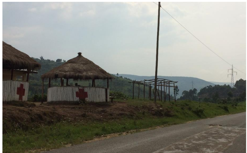
Road in Burundi, February 2016

Certainly, the socio-economic and political context is ripe for recruitment. With high levels of unemployment and few opportunities, levels of frustration among the youth are high. At the same time, there are many former fighters from previous wars both within Burundi and over the borders for whom demobilisation and reintegration has failed to deliver viable alternatives to fighting. One interviewee told of how he had been a child soldier during the 1990s: “[s]ince I was demobilised, no-one has come to ask about the conditions of life I lead. Many of these child soldiers have lost hope and are too sad. They have received no assistance since their demobilisation at Gitega in 2004. Those we served in the bush are now in power, while we live in misery.” 178