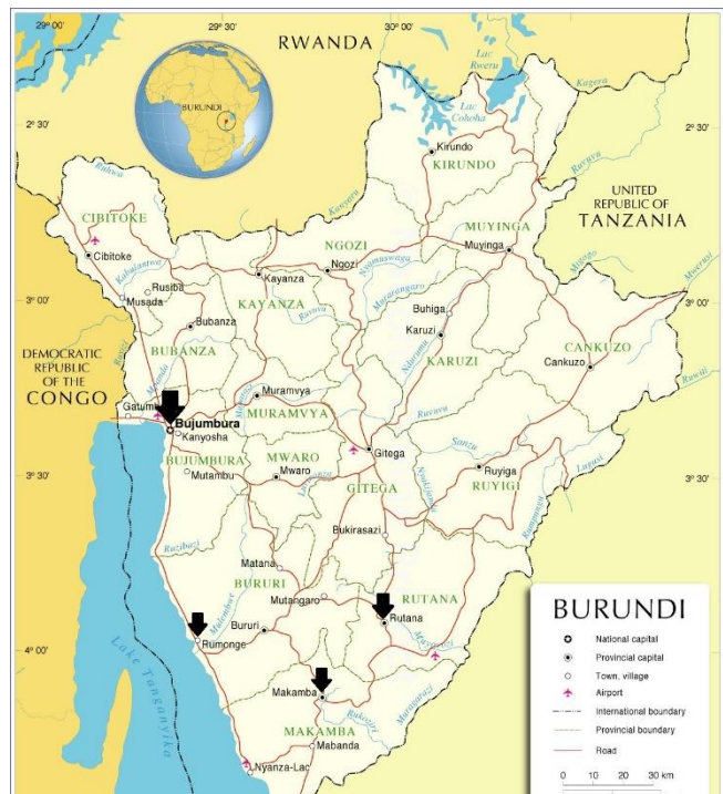
Burundi, Research locations marked with black arrows, map care of Nations Online.

The three provinces in southern Burundi where research was undertaken have all witnessed significant displacement since the beginning of the current crisis and in the past. Rumonge Province, where 20 interviews were conducted, has produced many refugees, who left for Tanzania and the DRC, and has also been known as a destination for opposition fighters and demonstrators who went