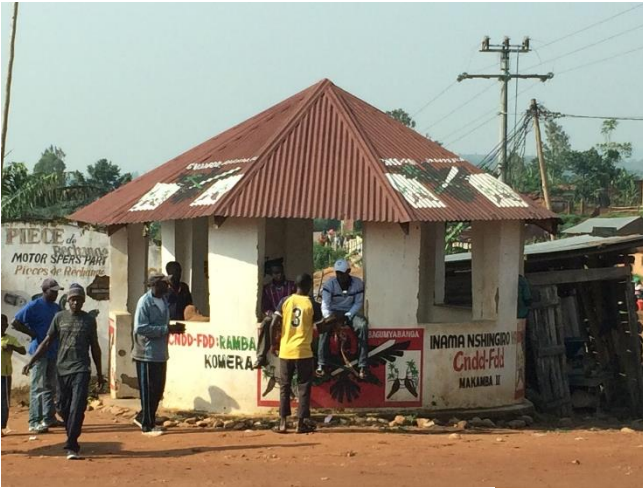
Burundi, February 2016

Decisions around whether or not to flee in the first place, whether to stay in exile or whether – and when – to return, are highly complex, particularly in a situation of limited resources and ongoing instability. Although exact figures are hard to ascertain, it is clear that a significant number of those who initially fled have subsequently returned. These