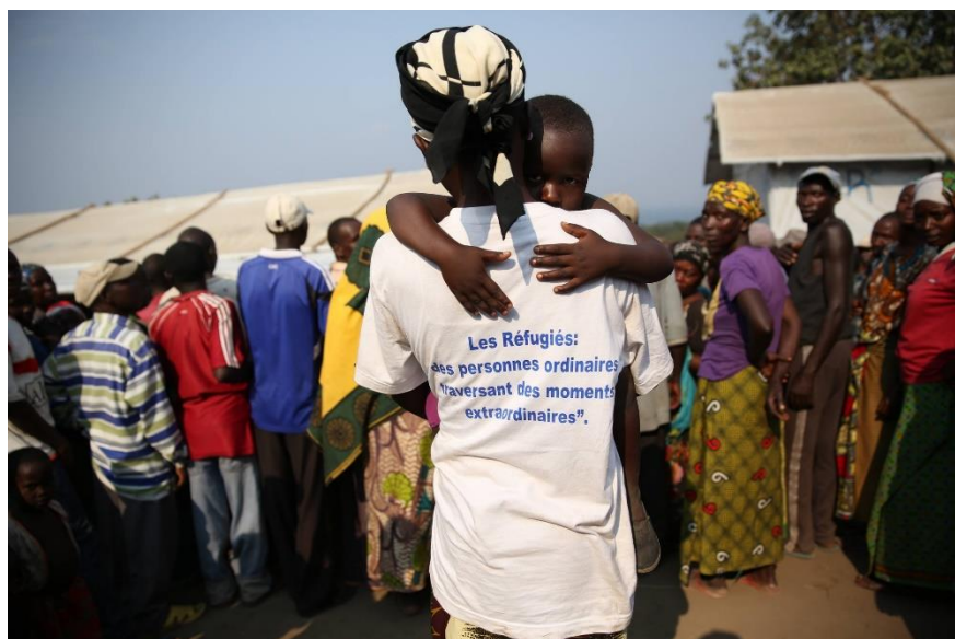
Burundian refugees in the Democratic Republic of Congo, 2015

More often, however, were stories of people returning to find their houses and fields looted. Some talked of this as being the work of criminals who had taken advantage of the situation, particularly in Bujumbura. As a pastor living in Musaga said, “criminals also take advantage of the situation to steal property using firearms. This kind of crime has become commonplace.” 135 In other cases it was neighbours – or even members of their family – who had taken advantage of refugees’ absence. As