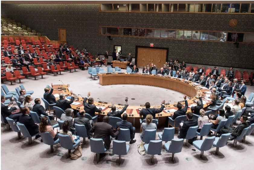
UN Security Council votes on deployment of UN police to Burundi, July 2016,

However many did differentiate between the imbonerakure , police and army. "[T]he authorities should instruct the police to bring order and security and not use the imbonerakure who are illegal. The authorities should stop them