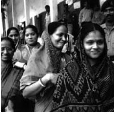
Hindu women line up to vote in elections in Dhaka, Bangladesh.