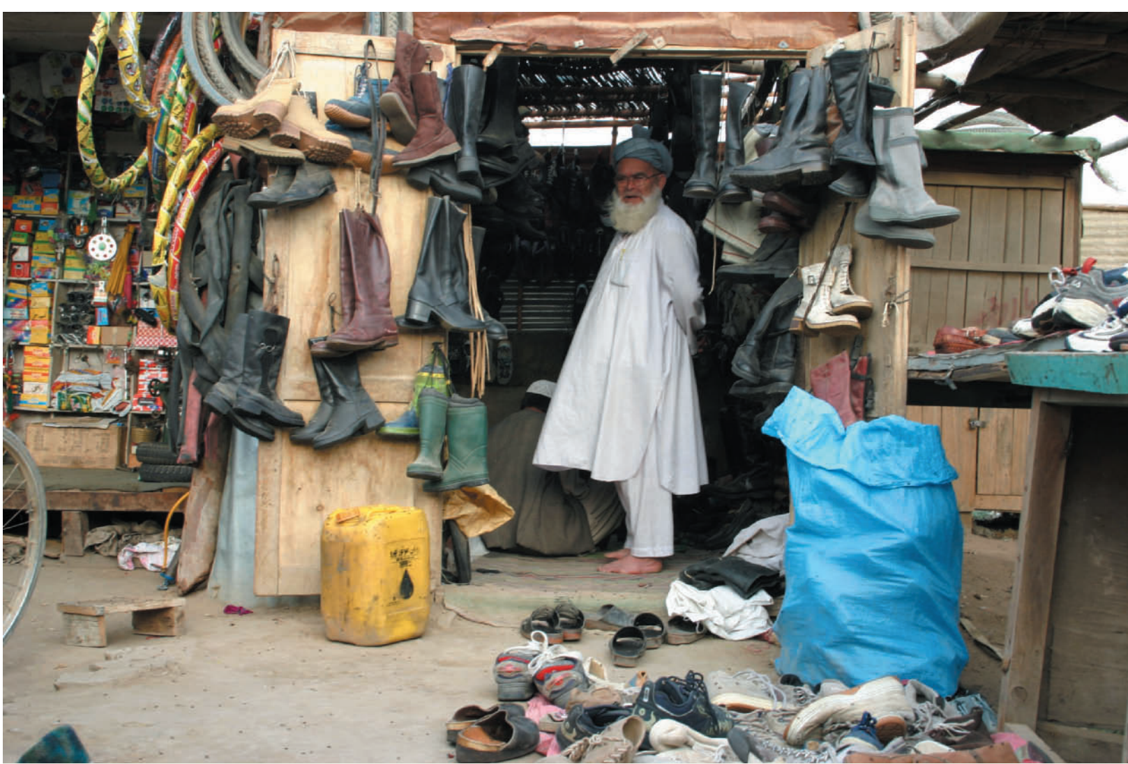
An Afghan refugee at a market in Karachi.

under arrest. Several training sessions and workshops were organized on international protection, targeting police officers, prison authorities and lawyers.