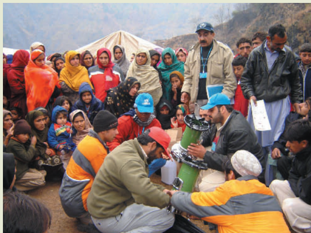
UNHCR staff demonstrate the installation of kerosene stoves distributed to families in Thuri Park camp, Muzaffarabad.

Approximately four million people were affected by the devastating earthquake of 8 October 2005 in the North-West Frontier Province (NWFP) and Pakistan-administered Kashmir. More than 73,000 died. Given the length and breadth of its experience in Pakistan, UNHCR stepped forward immediately to support the Government in its life-saving relief efforts for the victims.