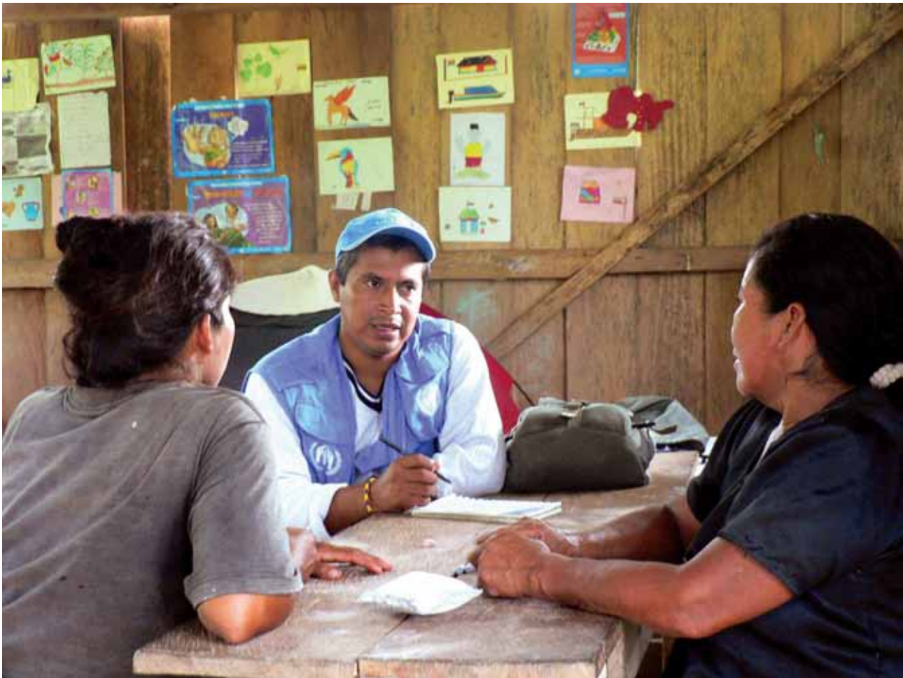
UNHCR staff in Ecuador visit remote communities like Lurimagua to inform Colombians about their right to ask for asylum after fleeing violence in their country.

for Refugees was inactive for parts of the year, mainly because of the electoral process, and the backlog of pending asylum cases increased considerably. Moreover, most asylum-seekers were not issued with documentation in spite of a specific legal provision to that effect. A training and awareness project on human rights and conflict prevention was launched near the border in Iquitos and Tumbes with the Ombudsman's Office and the Catholic Church.