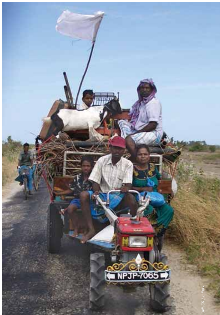
Continued fighting in the North and East of Sri Lanka in 2006 caused the displacement of some 200,000 people.

Access to conflict-affected areas was limited and relief agencies were barred from entering certain areas, hampering the implementation and monitoring of projects. The situation was made more intractable because many IDPs suffered multiple displacements in 2006. The general climate of fear and high security risks, especially since relief workers were targeted, hurt humanitarian programmes.