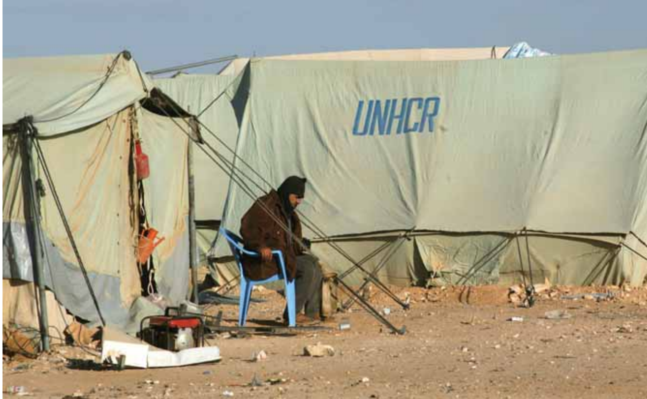
Denied entry into the Syrian Arab Republic, Palestinian refugees fleeing death threats in Baghdad have been stranded in no-man's-land since May 2006.

against children. Iraqis are affected by their precarious legal situation, lack of income, exploitation and discrimination, loss of family and friends, and traumatic experiences in Iraq.