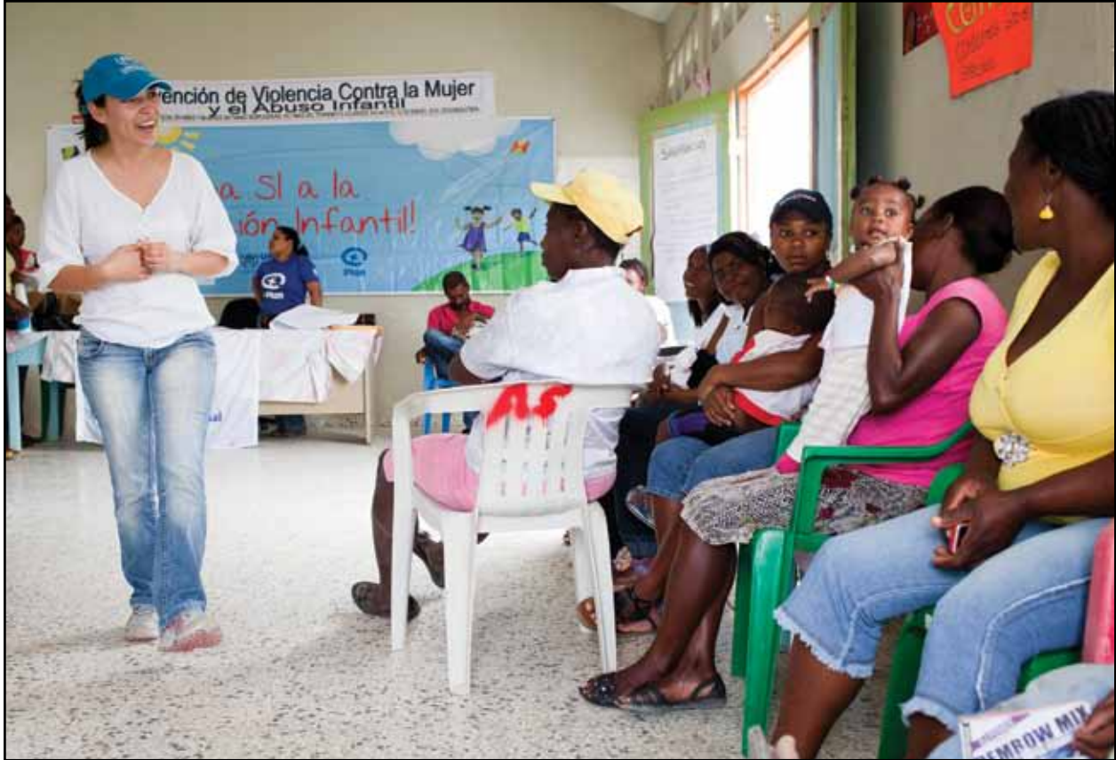
A UNHCR protection officer addresses adults at a protection workshop run by Plan International in the remote town of Elias Piña, Dominican Republic, near the border between the Dominican Republic and Haiti.

consequences of statelessness “so as to promote increased understanding of the nature and scope of the problem of statelessness, to identify stateless populations and to understand reasons which led to statelessness, all of which would serve as a basis for crafting strategies to addressing the problem”. 22