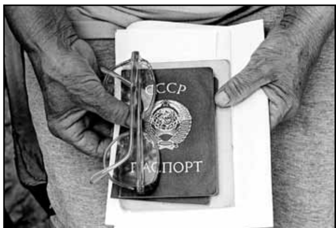
The break-up of the Soviet Union created legal and bureaucratic obstacles that still affect people today. Here, a woman from Ukraine holds her expired Soviet passport.

In summary, USCIS statistics provide that, during fiscal years 2005 to 2010, in addition to asylum applications from stateless persons pending at the outset of 2005, 628 stateless persons sought asylum affirmatively at the asylum offices, 102 283 stateless persons were granted asylum, 23 were denied asylum, and 359 had no final decision reached on their application, but were instead placed in removal proceedings 103 and referred to immigration court to have their asylum claim decided by an immigration judge. 104 The EOIR statistics for the same six-year period indicate that 1,087 stateless persons sought asylum defensively before the immigration court, 463 stateless were granted asylum, 166 were denied such relief, and 295 either abandoned or