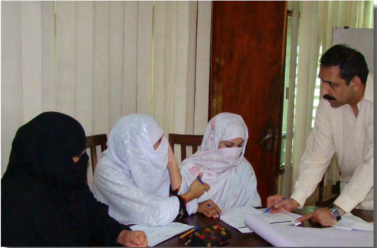
— GROUPWORK DURING THE FOCUS GROUP DISCUSSIONS