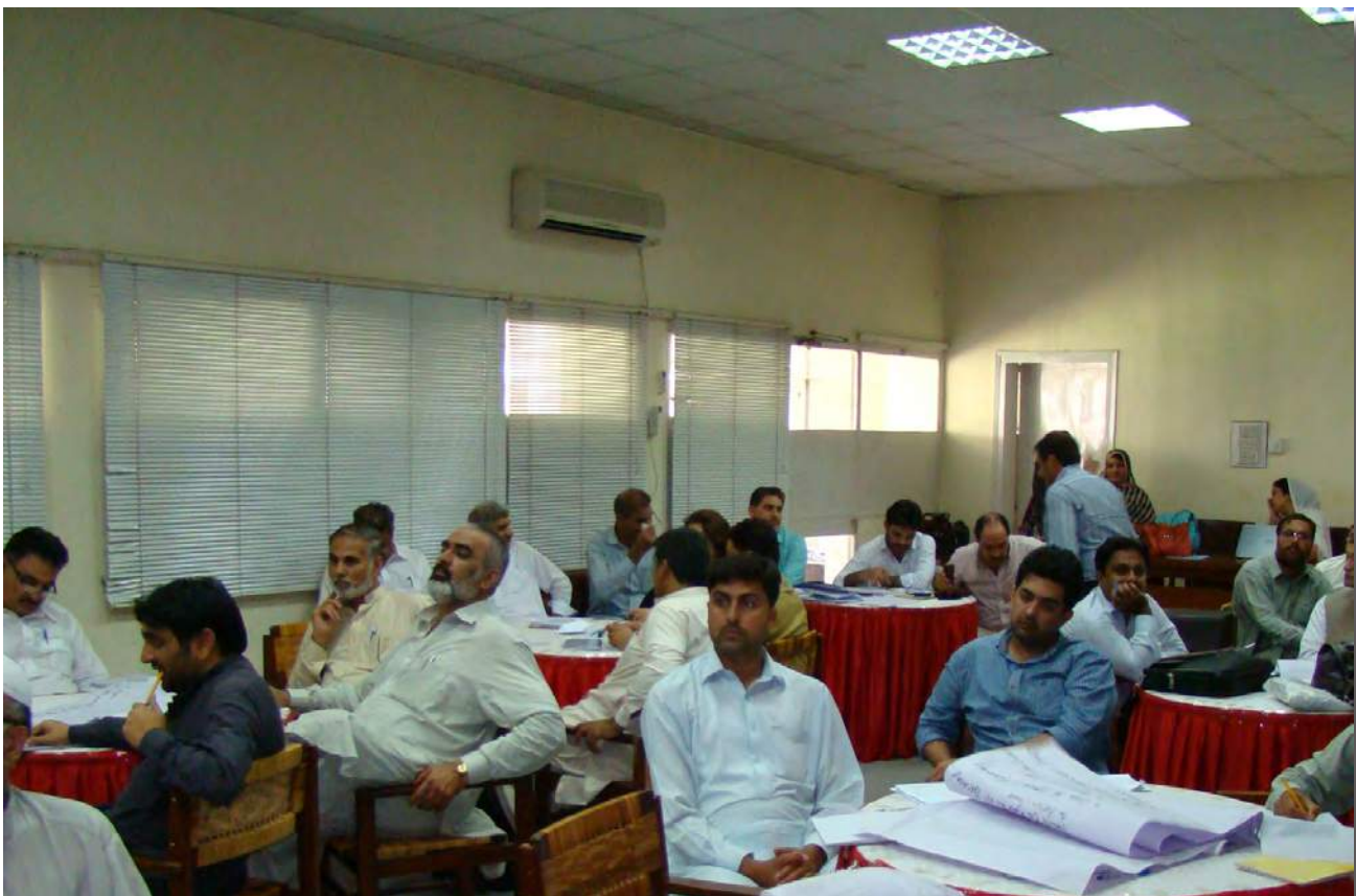
— STAKEHOLDERS LISTEN AS OTHERS PRESENT IN A WORKSHOP