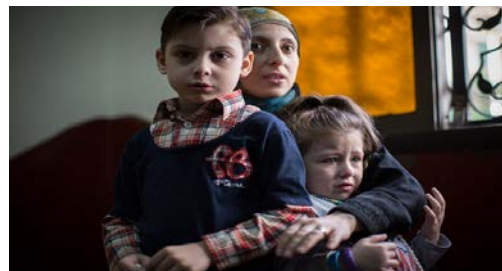
Syrian woman with her children attending an awareness session

Additional opportunities for resettlement and other forms of admission, including humanitarian visas, academic scholarships, and labour mobility schemes, are also needed.