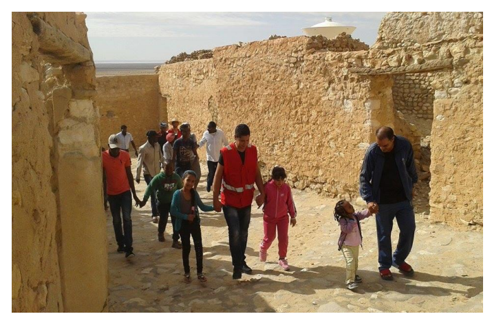
Go-and-see visit organized by UNHCR's partner IRT in Tozeur for 30 refugee children and youth from 29 to 31 October.