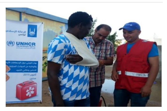
First aid training conducted on 15-16 October for refugees in Medenine.