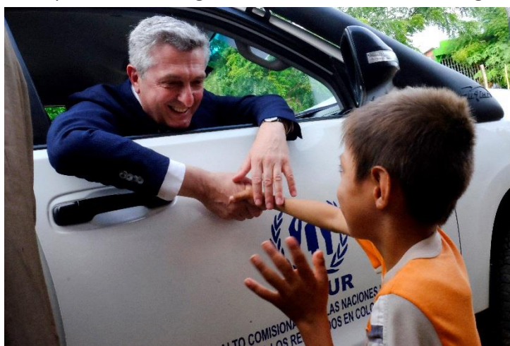
UNHCR 2016 – Colombia. Visit of the United Nations High Commissioner for Refugees Filippo Grandi