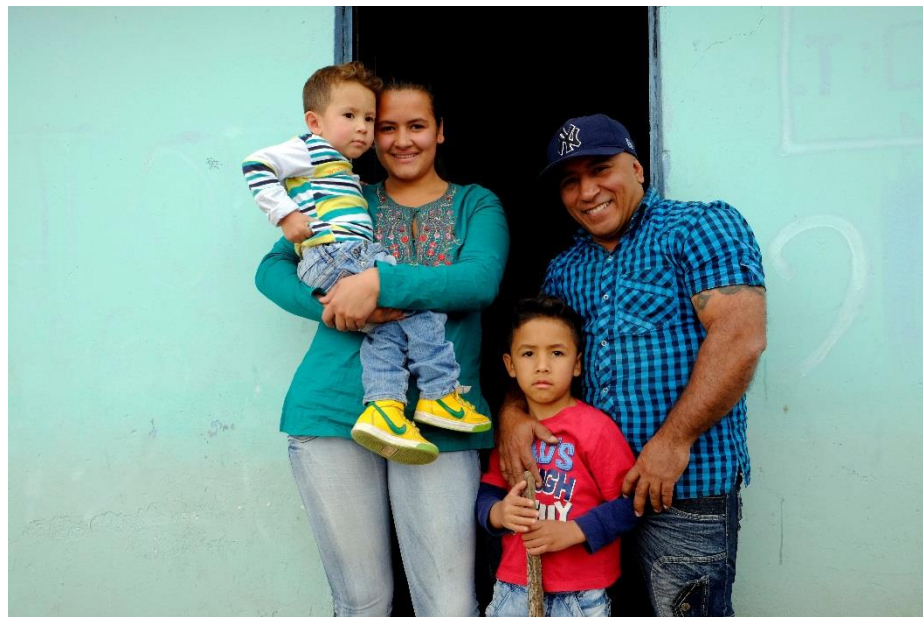
UNHCR 2016 – Ecuador - Refugee family from Colombia part of the Graduation Model pilot project.