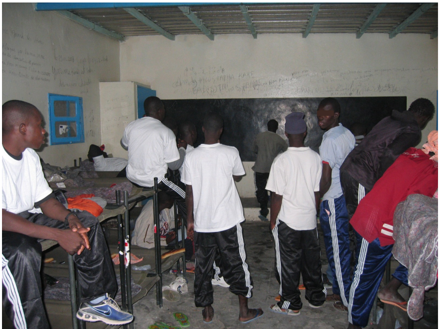
Migrants in the Nouadhibou Detention Centre

Corroborating information indicates that some members of the security forces do carry out arbitrary arrests of foreign nationals, notably nationals of ECOWAS countries. These people, arrested in the street or at home, apparently without any evidence, were allegedly accused of intending to leave Mauritania irregularly to travel to Europe. Some of these people, held at the detention centre at Nouadhibou to await being sent back to Mali or Senegal, told the Amnesty International delegation that they were legally present in Mauritania and that, at the time of their arrest, the security forces had torn up their residence permits. Amnesty International fears that these arbitrary arrests are one of the perverse effects of the pressure exerted by the EU on the Mauritanian government.