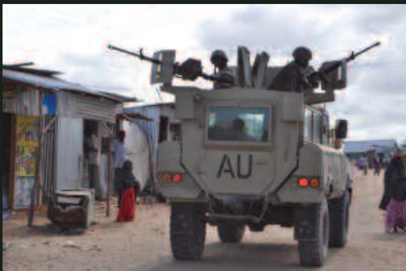
AMISOM troops patrolling the Zona-K camp for displaced people in Mogadishu's Hodan district in June 2012.

Human Rights Watch urges troop-contributing countries to appropriately punish perpetrators and ensure survivors are adequately supported. It calls on the AU and AMISOM to foster an organizational culture of “zero tolerance” of unlawful activities on their bases. International donors should closely monitor AMISOM and take action when AMISOM forces are committing sexual exploitation and abuse and when the relevant authorities have failed to take the necessary corrective measures.