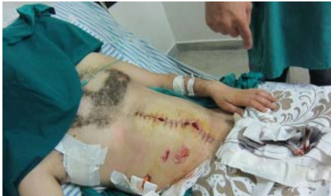
An injured demonstrator receiving treatment in a private medical facility.

A medic who provides life-saving treatment in secret locations to injured demonstrators