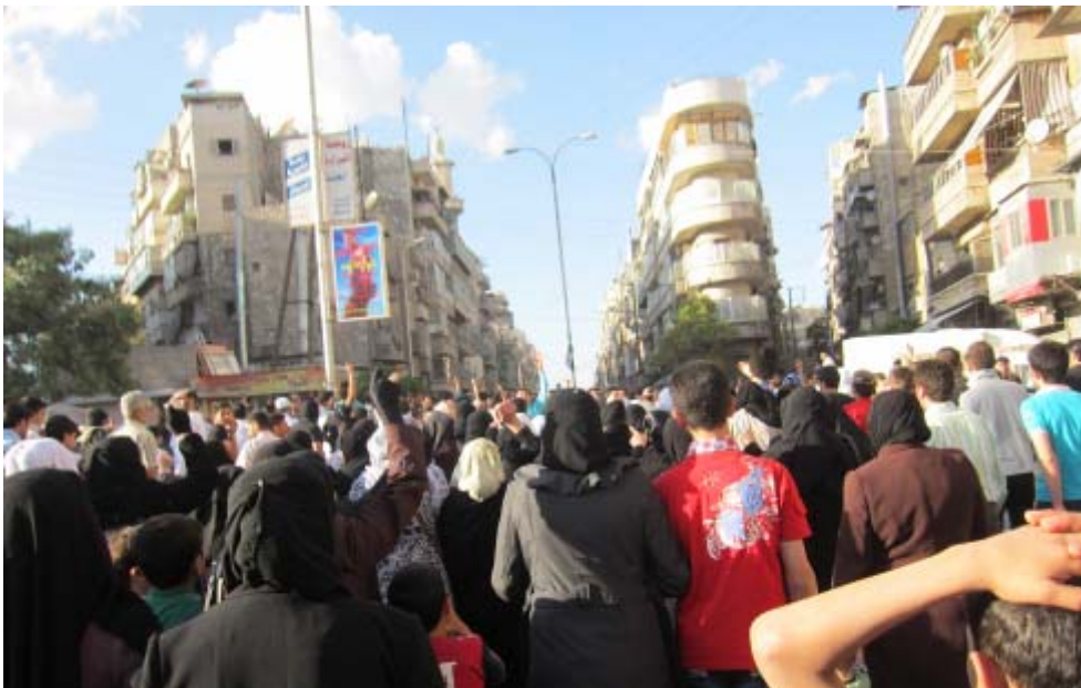
Funeral-turned-demonstration in Aleppo City (Bustan al-Qasr district) on 25 May 2012.

Amnesty International delegate in Aleppo city at the end of May 2012