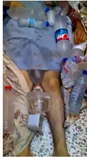
A body is being cooled by iced water bottles as many families are too afraid to take bodies of relatives shot dead to the morgue.

Another doctor, similarly active in the medical solidarity network, was abducted near his home in early July, taken to an unknown place where he was severely beaten and threatened. He was released hours later, unable to walk from the injuries sustained. He left his home and went into hiding.