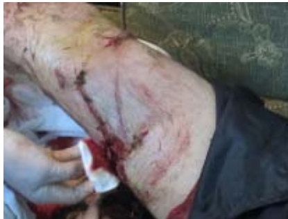
An injured demonstrator receiving treatment at a field hospital.

“I don't know if they believed me. I paid a lot of money to the security forces who were in the hospital for them not to file a report about my case to their headquarters. Even though I paid a big bribe, there was still the risk that if other security agents found out about my case they would have arrested me. I left the hospital as soon as I could, well before I should have. I have been getting treatment from sympathetic doctors who check and dress my wound regularly. This treatment is not as it would be in a hospital and this why it is taking longer to recover, but it is better than being arrested and tortured.”