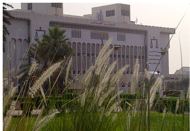
The Palace of Justice, Kuwait City, which houses Kuwait's highest courts

This chapter features some of the most serious of these cases that Amnesty International has documented.