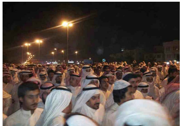
A demonstration outside Kuwait Central Prison, calling for the release of opposition politician Musallam Al-Barrak, Kuwait, 31 October 2012.

The government has used existing laws and adopted new ones to target its critics, including human rights defenders and political opponents, and ultimately close down space for dissent. Judicial authorities have ordered the suspension or closure of newspapers and other media platforms. The government has invoked the country’s nationality law to strip some of its critics of their citizenship, sending a stark warning to others of the consequences of speaking out. Members of Kuwait’s Bidun community, who are denied Kuwaiti nationality, have been among those arrested and imprisoned for peacefully exercising their right to freedom of expression.