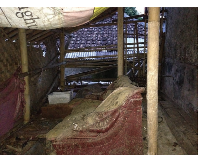
A woman with a psychosocial disability was locked up in this chicken coop. The coop is located behind the house and is covered in chicken droppings.