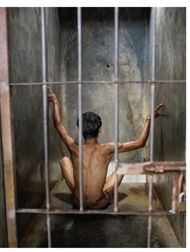
A man sings in his cell, his hands moving in an intricate dance, at Pengobatan Alternatif Jasono, a traditional healing center in Cilacap, Central Java.