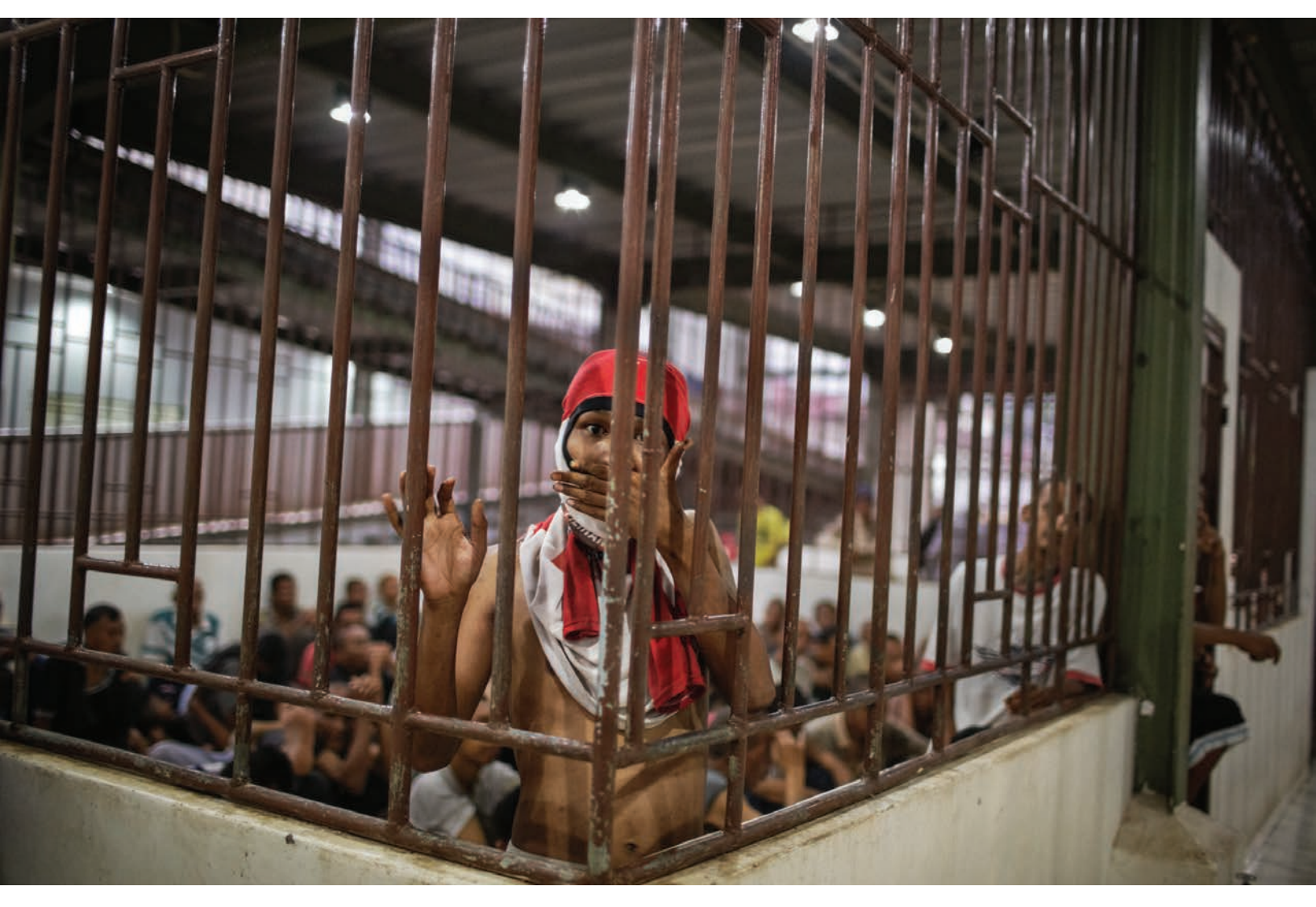
Men with psychosocial disabilities are locked up in a crowded room in the male section of Galuh Rehabilitation Center in Bekasi.

In the traditional or religious healing centers, personal hygiene is a serious problem as people are chained and do not have access to a toilet. As a result, they urinate, defecate, eat, and sleep in a radius of no more than one to two meters.