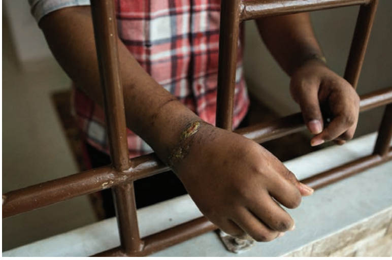
A male resident staying in the isolation room at the Galuh Rehabilitation Center in Bekasi has wounds on his arms resulting from being tied.