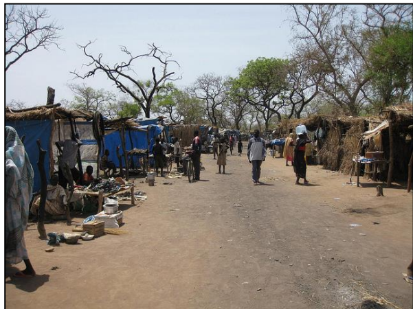
Yida refugee camp market.

As a result, displacement within and from SK – including both GoS held areas and SPLM-N held areas – has been considerable. It is also increasing on a daily basis. As another IDP man living in Um Dorein County said, “Almost the whole county of Um Dorein is either now an IDP in the county or a refugee in South Sudan. As for me, my whole family is scattered to Kadugli, Khartoum, South Sudan and some here in Um Dorein.” 38 Many have had no choice but to move within SK or to leave the state altogether, fleeing to South Sudan. For others, the fact that they are still living in SK is due to a lack of alternatives in a broader context in which displacement often leads to greater danger. As one man asked, “Where else would I go? I have no choice to move to anywhere.” 39 Or as a woman, who identified herself as being Arab, said: