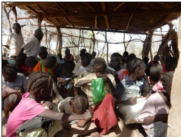
Students in Delami County take exams sitting on stones.

While recognising that choices are severely limited in this context, many also saw a refusal to be displaced – either from their homes, or from rebel held areas of SK – as a form of defiance in the face of attacks which, they believe, are intended to force them off their land. As a woman living in Delami County said, "Many of my family are in Yida, but I made a decision by myself to stay here and