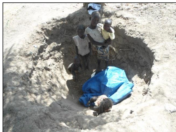
Children in a foxhole, Southern Kordofan.

Adequate response, therefore, is key. It is also currently absent. While primary responsibility for the situation lies with the government, its ability to protect its own civilians has not only been shown to be lacking, but it has shown itself to be the cause of attacks. It is up to external actors, therefore, to recognise and work with the resilience of those living through this conflict and act decisively to bring this conflict to a swift resolution.