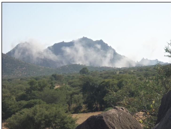
Bombings of Adouna village, Delami County, 6 November 2014.

This report highlights the voices of those civilians living in the midst of this conflict. Based on 52 qualitative interviews in three counties in the rebel held areas of SK, and building on the findings of a trusted team of human rights monitors who have been working to monitor the impact of the conflict on civilians since the current round of conflict started in June 2011, 5 the report highlights both the devastating impact of the conflict on every aspect of people’s lives, as well as the resilience and resistance of the civilian population who are living through it.