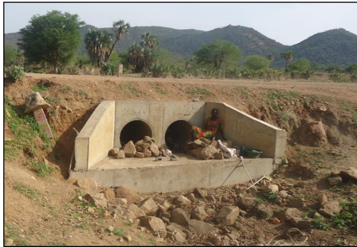
IDPs inside a small bridge below the main road.

Militarily, therefore, the war has reached something of an impasse, with the civilian population suffering the consequences.