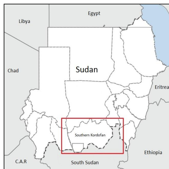
Southern Kordofan State, Sudan.

Southern Kordofan State is located in the southern part of Sudan, with South Sudan to its south, and Sudan’s North Kordofan, White Nile and South Darfur States to the north, east, and west respectively. The Nuba Mountains, occupying more than one third of the state’s 120,000 square kilometres, are located at its centre. The rest of the state is fertile, arable land. With the oil-rich region of Heglig at its south and the disputed Abyei region at its south west, SK arguably became Sudan’s most strategic borderland after its separation from South Sudan in 2011. 11