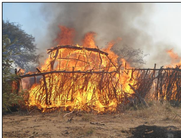
Village of Tunguli, 8 November 2014.

As a result of the fear and destruction caused by bombing and shelling, in addition to the fact that large areas remain covered in landmines left over from the previous round of conflict, communities in SK are often unable to work their lands, and food insecurity has reached crisis levels in large areas of the state. 26 In addition, health services, as well as education services, are limited and often not