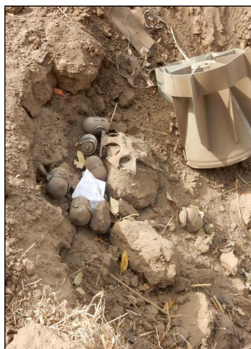
A cluster bomb, Southern Kordofan, 2015.

Of course, the benefit of South Sudan’s independence has been tempered by the outbreak of war at the end of 2013, which has undermined the country’s ability to offer protection to refugees. As an elderly man, displaced and living in Um Dorein County, said, “[The war in South Sudan] has made it worse because now we feel restricted as we have only one active road to South Sudan.” 63 Yet the possibility of having a neighbouring country to which people can escape remained: “Even though South Sudan is another country, the people in Southern Kordofan can still go to and come back from there without a passport.” 64