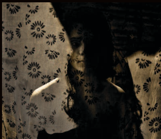
A Hijra in Dhaka, Bangladesh.

The government of Bangladesh took an important step in declaring its recognition of hijras, but, for the reasons detailed in this report, it urgently needs to implement a rights-based procedure that privileges identity over medical intervention for their recognition. Anything less will leave hijras exposed to further abuses.