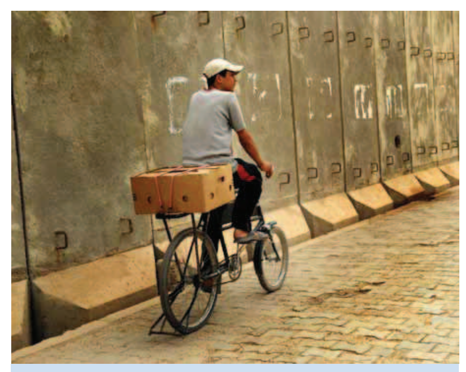
A boy rides his bicycle alongside a strip of T-Walls in Baghdad.