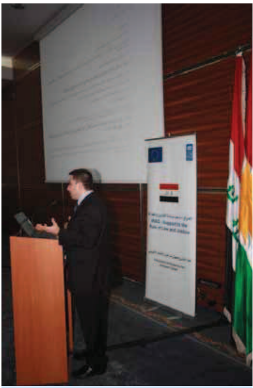
UNDP legal aid workshop for Kurdistan Bar Association held in Erbil on 25 May 2011.