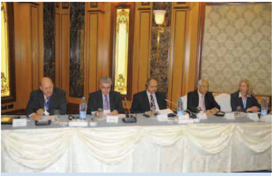
Members of the panel at the opening session of the UN-Habitat Conference on Iraqi governance held on 15 May 2011 in Amman, Jordan.

ey representatives of the Iraqi government, including Mr. Istebraq al-Shauk, Senior Deputy Minister for Construction and Hous-