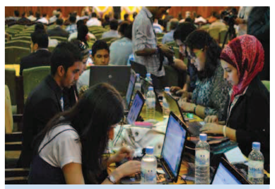
Members of Iraq's newly launched Bloggers Union uploading updates on the celebration of the World Freedom Day's events celebrated in Baghdad on 3 May 2011.

he UNESCO Office for Iraq held its celebration for World Press Freedom Day 2011 at the Oil Cultural Center in Baghdad on 3 May. Iraqi bloggers seized on this year's theme, "21st Century Media: New Frontiers, New Barriers" to announce the formation of the first Iraqi Bloggers Union to be called "Iraq First."