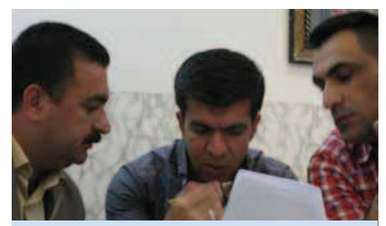
WHO staff discuss gathering information to help the Directorates for Tracing Violence Against Women.

he Directorates for Tracing Violence Against Women are an important part of the Kurdistan Regional Government's response to Violence Against Women in Iraq as they ensure that victims have access to medical, legal and police support. On 24-25 May 2011, the leadership and technical staff from the Directorates met in Dohuk, Iraq, with the support of UNDP Iraq technical staff, to develop a strategic plan and harmonize efforts to train the Directorate