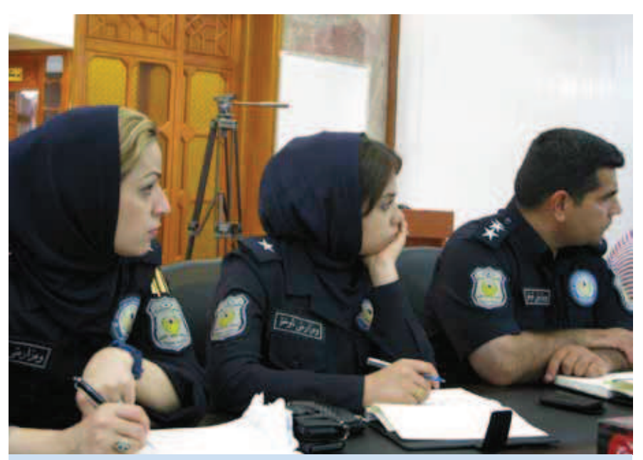
Directorate staff prepare for meetings on strategic planning and the coordination of statistics collection throughout the Kurdistan region.

to victims, prevent violence by raising awareness about the issue among perpetrators of violence and advocate for laws so that police can better address violence in the community.