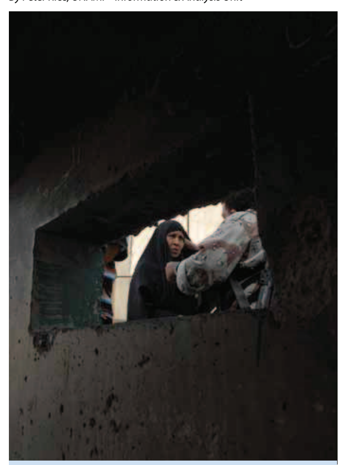
A woman is stopped at checkpoint in Baghdad.

By Peter Rice, UNAMI - Information & Analysis Unit