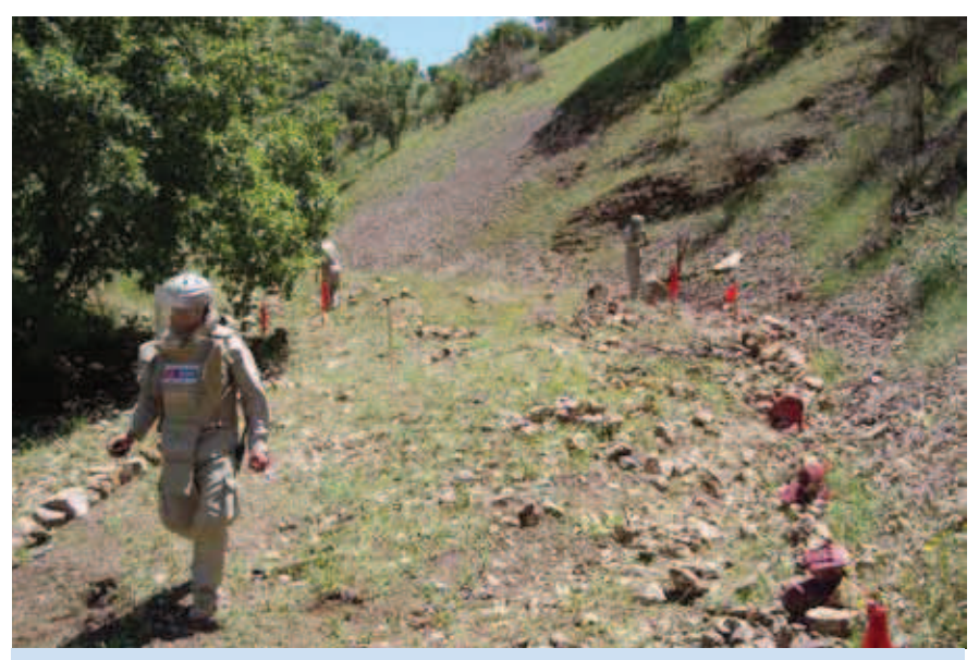
The Mines Advisory Group team safely remove mines from a small village in the governorate of Sulaymaniyah in May 2011.

he Mines Advisory Group (MAG) has partnered with International Organization for Migration (IOM) Iraq to safely remove landmines from a karez restoration site in the northern governorate of Sulaymaniyah.