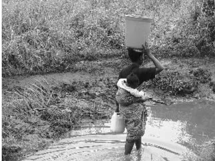
New boreholes were dug and new water points were created to reduce the distance refugee women have to walk to find fresh water.

Legal Assistance: Funding was provided for the Legal Assistance Project in the Office of the