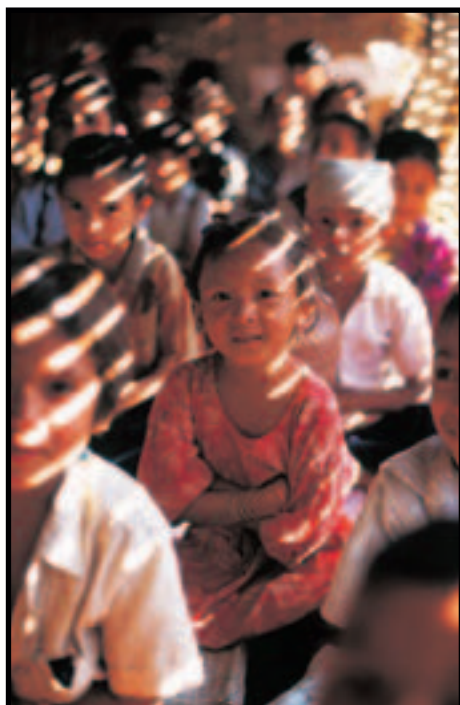
Many stateless persons are denied even basic human rights, but at least these children from Bhutan enjoy primary school while they await their fate in Nepal.

Because refugee and statelessness problems sometimes overlap and may be interdependent, UNHCR has been designated by the UN General Assembly to effectively become the overseer and guardian of the world's stateless people and the various efforts to help them.