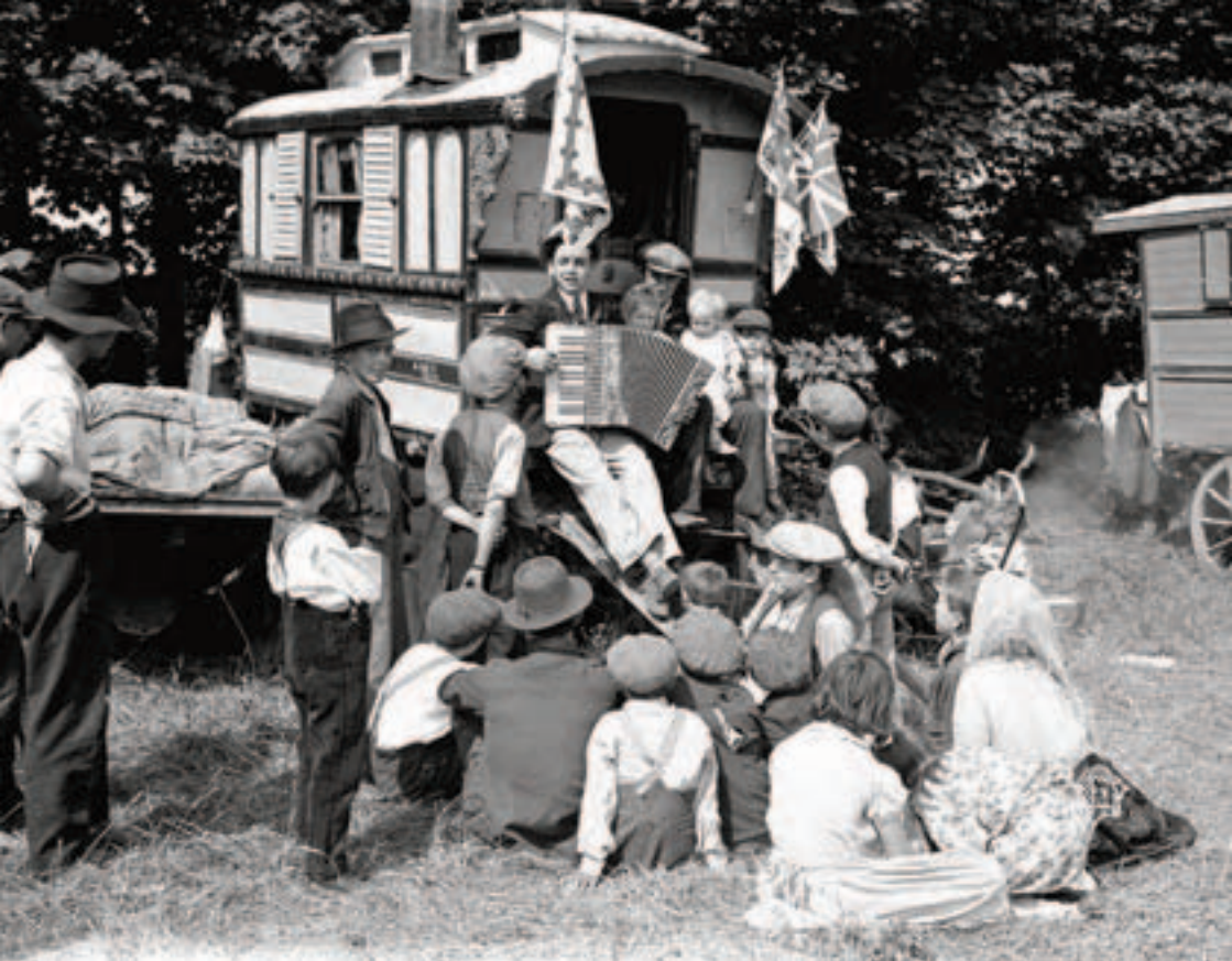
The Roma have been victimized for decades in parts of Europe and are often stateless.

P ARENTS CANNOT OFFICIALLY REGISTER the birth of a newborn baby. As the child grows, he or she may not be able to attend school or university, obtain a job, travel or even get married. And when these children grow old and die, they may suffer the final indignity – an anonymous burial without any official trappings or recognition.