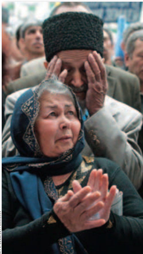
Crimean Tatars in Simferopol, Ukraine, during a 60th anniversary ceremony commemorating their mass deportation to Central Asia during World War II.