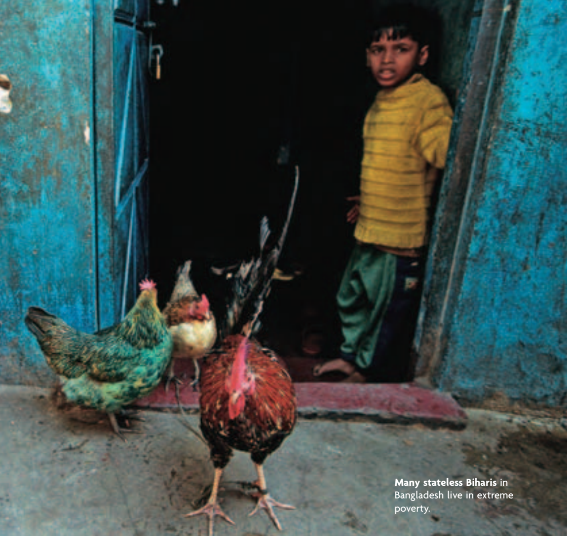
Many stateless Biharis in Bangladesh live in extreme poverty.

“A CONTRACTING STATE MAY NOT DEPRIVE ANY PERSON OR GROUP OF PERSONS OF THEIR NATIONALITY ON RACIAL, ETHNIC, RELIGIOUS OR POLITICAL GROUNDS.”