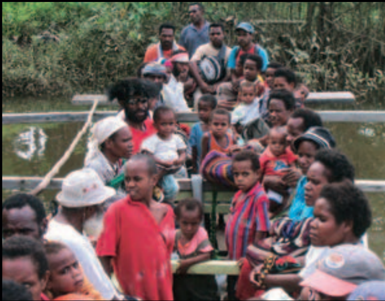
Many of the Indonesian refugees in Papua New Guinea are stateless.