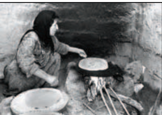
Many Kurds became stateless as the result of the war between Iran and Iraq.

* Some countries use the word 'nationality,' others 'citizenship' to denote the legal bond. In this brochure, both are used synonymously.