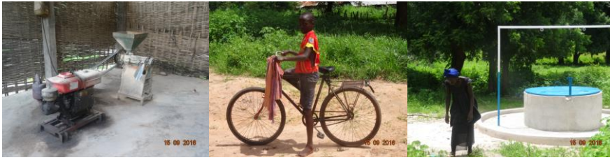
Rice Rusker provided to refugees in Cacheu / Refugee child using bicycle provided by IP / Local communities benefiting from well funded by UNHCR for irrigation for agricultural purpose