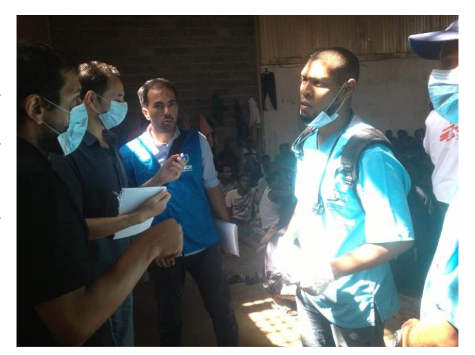
UNHCR partner's IMC is providing basic health assistance to detainees in the detention centers regularly visited.