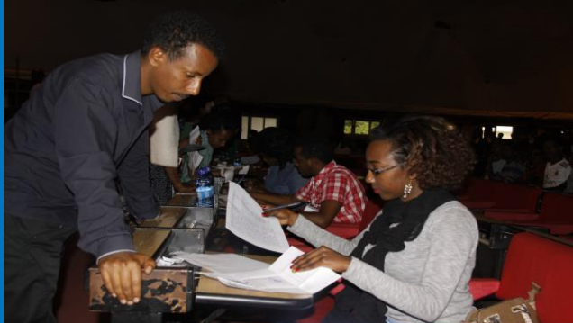
UNHCR and ARRA staff verifying urban-based Eritrean refugees in Addis Ababa