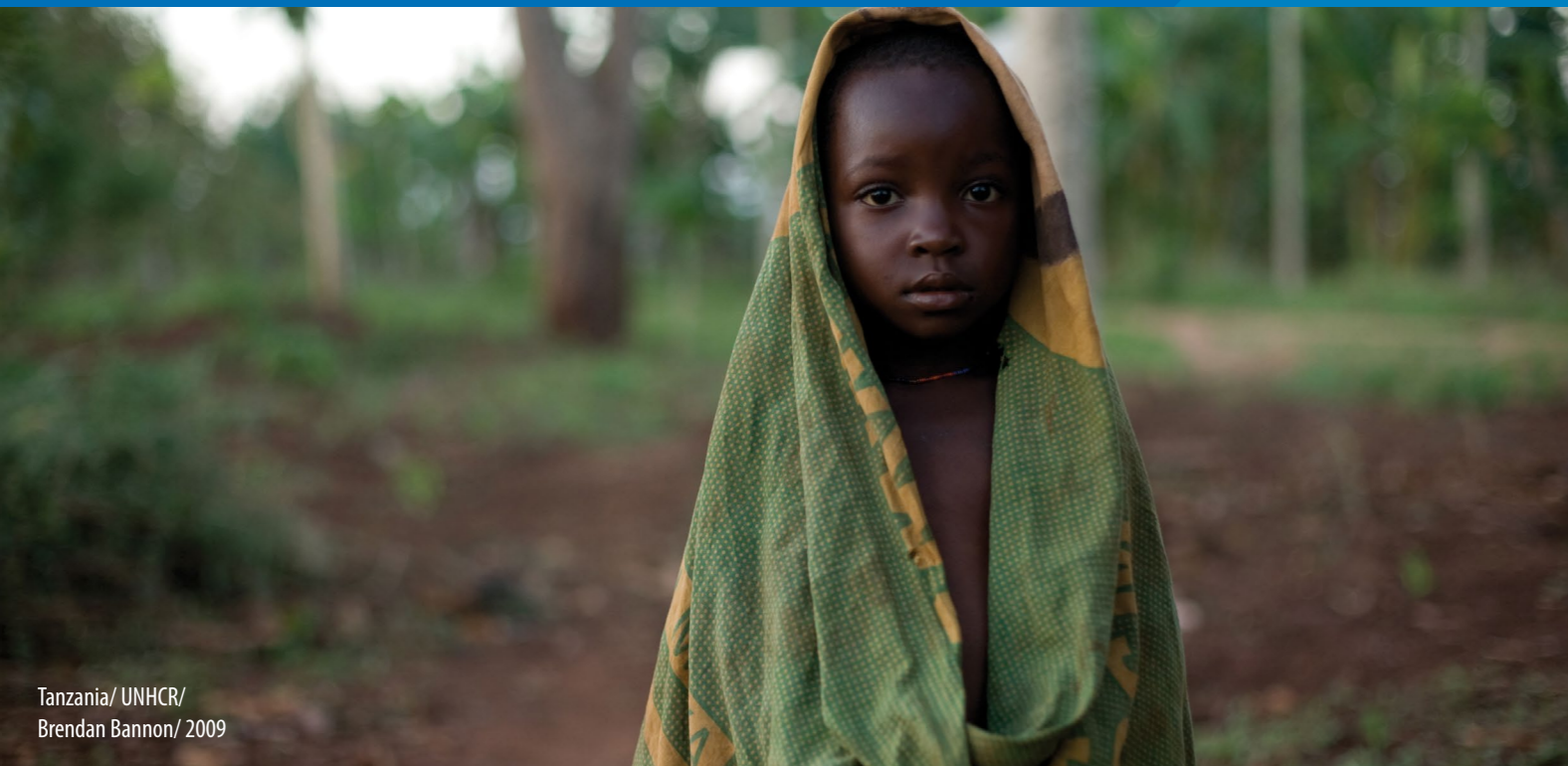
Tanzania/ UNHCR/ Brendan Bannon/ 2009

Through the Alternatives to Camps Series, UNHCR provides key guidance, useful approaches, tools and good practices to support the implementation of the key actions outlined in the Policy on Alternatives to Camps . The Series also includes a call for sharing your good practices.