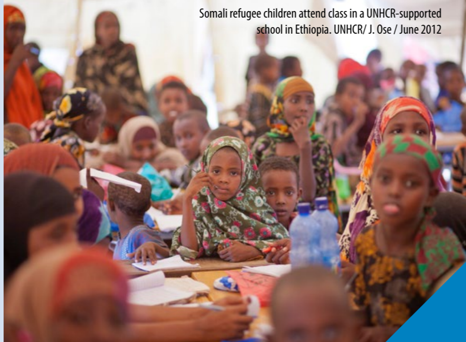
Somali refugee children attend class in a UNHCR-supported school in Ethiopia.

Coordination with MOH and UNHCR's health partners ensured consistent and transparent messaging to the Syrians refugees. Several barriers still exist to the utilisation of services by the poorest refugees. UNHCR supports these refugees in accessing the regular national health services and monitors access and utilisation of the services through the Household Access and Utilization Survey (HAUS) , which ensures support for refugees who cannot afford the fees.