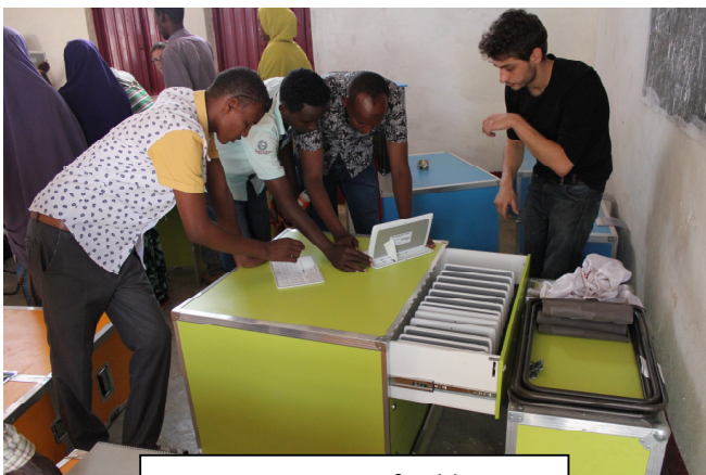
Presentation of Tablets