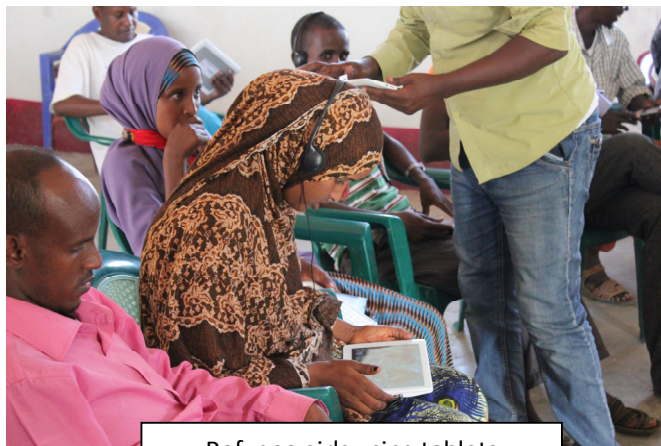
Refugee girls using tablets