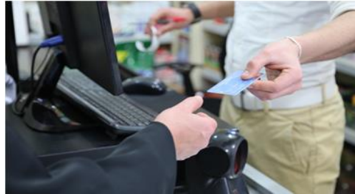
A Syrian woman paying for her food with WFP's e-card, North Lebanon.

Assessments by sector actors in Lebanon will also allow for better understanding of the impact of the crisis on the agricultural labour market.