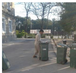
Residents help cleaning of the RC, Presevo (Serbia) @UNHCR, 28/09/16

The Presevo Reception Centre (RC) accommodated 704 refugees and migrants, most from Afghanistan (60%), Iraq (17%) or Syria (12%), and only 10% from other countries. About half are children.