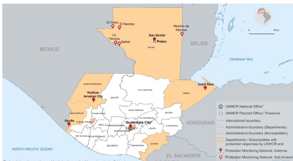
UNHCR Guatemala: Operational Map May 2016

1 national office located in Guatemala City