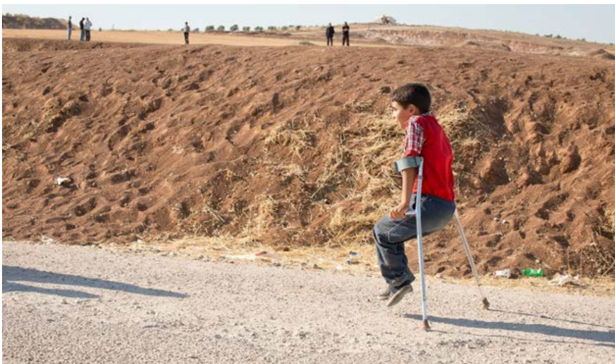
A young Syrian refugee enters Jordan on crutches.

friendly spaces. Children also receive psychosocial support through NGOs and community centres, as well as at UNHCR registration centres.