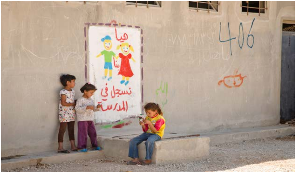
A mural painted by children in Za'atari refugee camp that says "Let's go register for school."

Many children must walk to school. Parents and protective older siblings in both countries described their concerns that pupils—particularly younger children and girls—will be unsafe or get lost. Some therefore keep them at home. Others insist on the importance of education and, though wary about safety, let them walk alone.