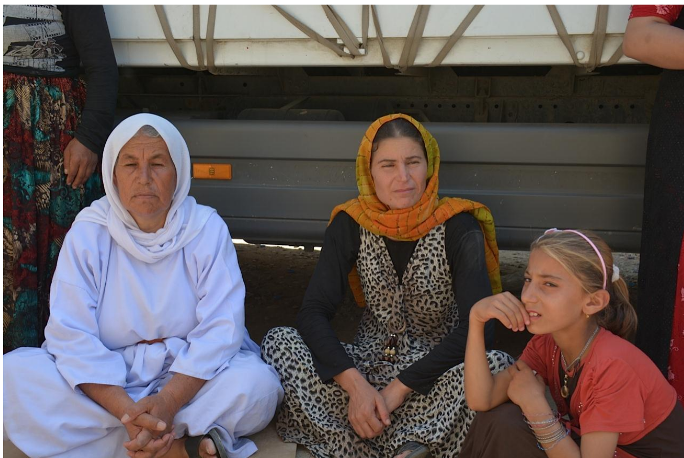
Three generations of Yazidi women displaced in Shekhan village, Dohuk Governorate.

The population of IDPs throughout Iraq consists of various groups, including some minority groups such as Christians, Yazidis, Shabak, Armenian, Turkmen; some of them have endured multiple displacement.