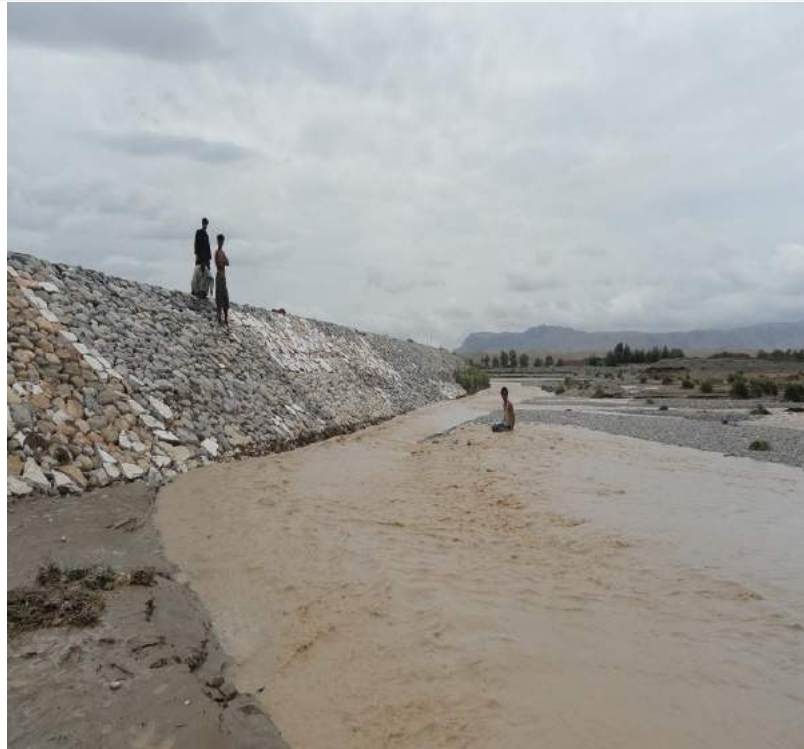
Zar Karez 3—Flood Protection Walls