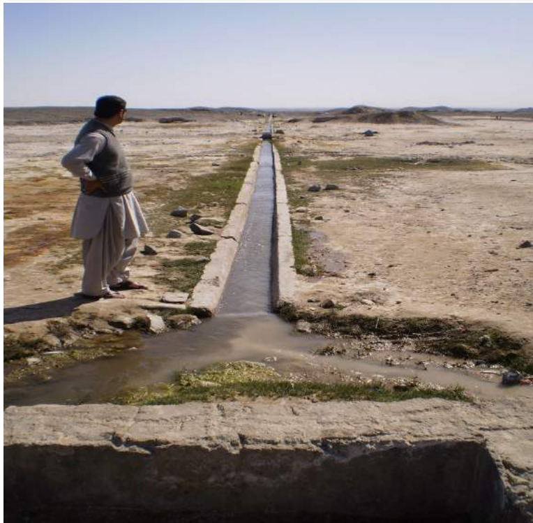
Water Channel in Loralai, Balochistan