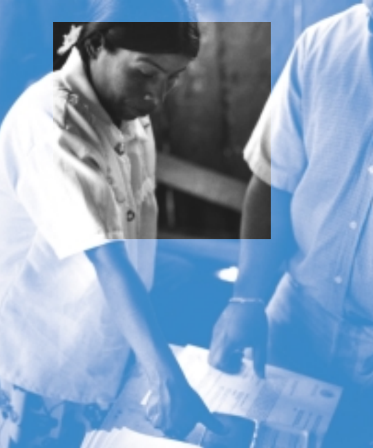
A Guatemalan refugee in Chiapas, Mexico