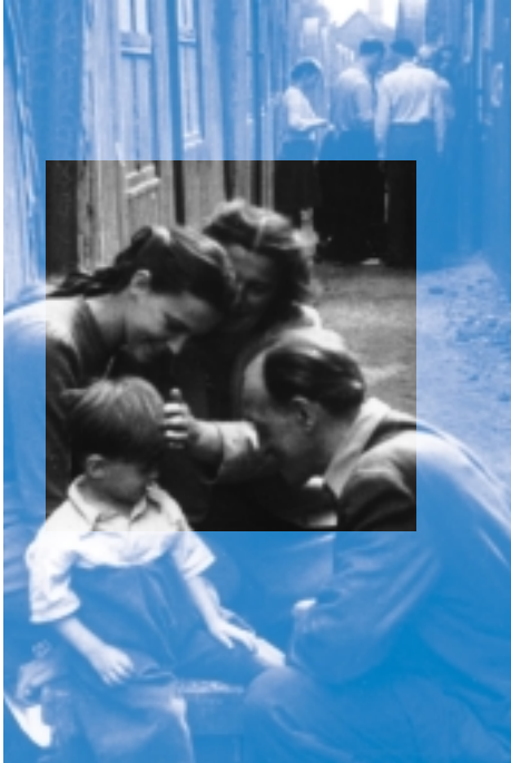
European refugees in a camp in Germany in 1953