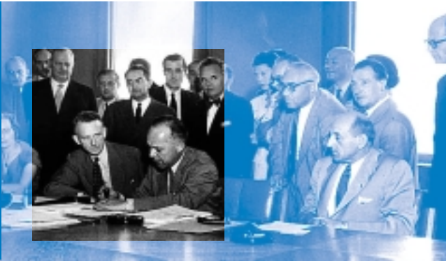
The 1951 Convention was adopted on 28 July 1951 and opened for signature.