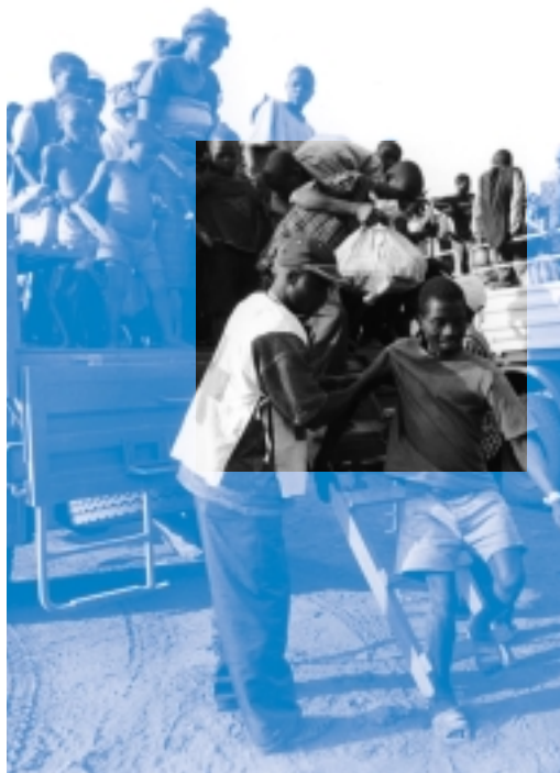
Refugees from Liberia and Sierra Leone in Guinea

Nothing in the 1951 Convention or its Protocol gives preferential treatment to refugees, by requiring signatory States to offer them land. They must simply apply the same criteria to refugees as they do to other categories of foreigners when negotiating the sale of land.