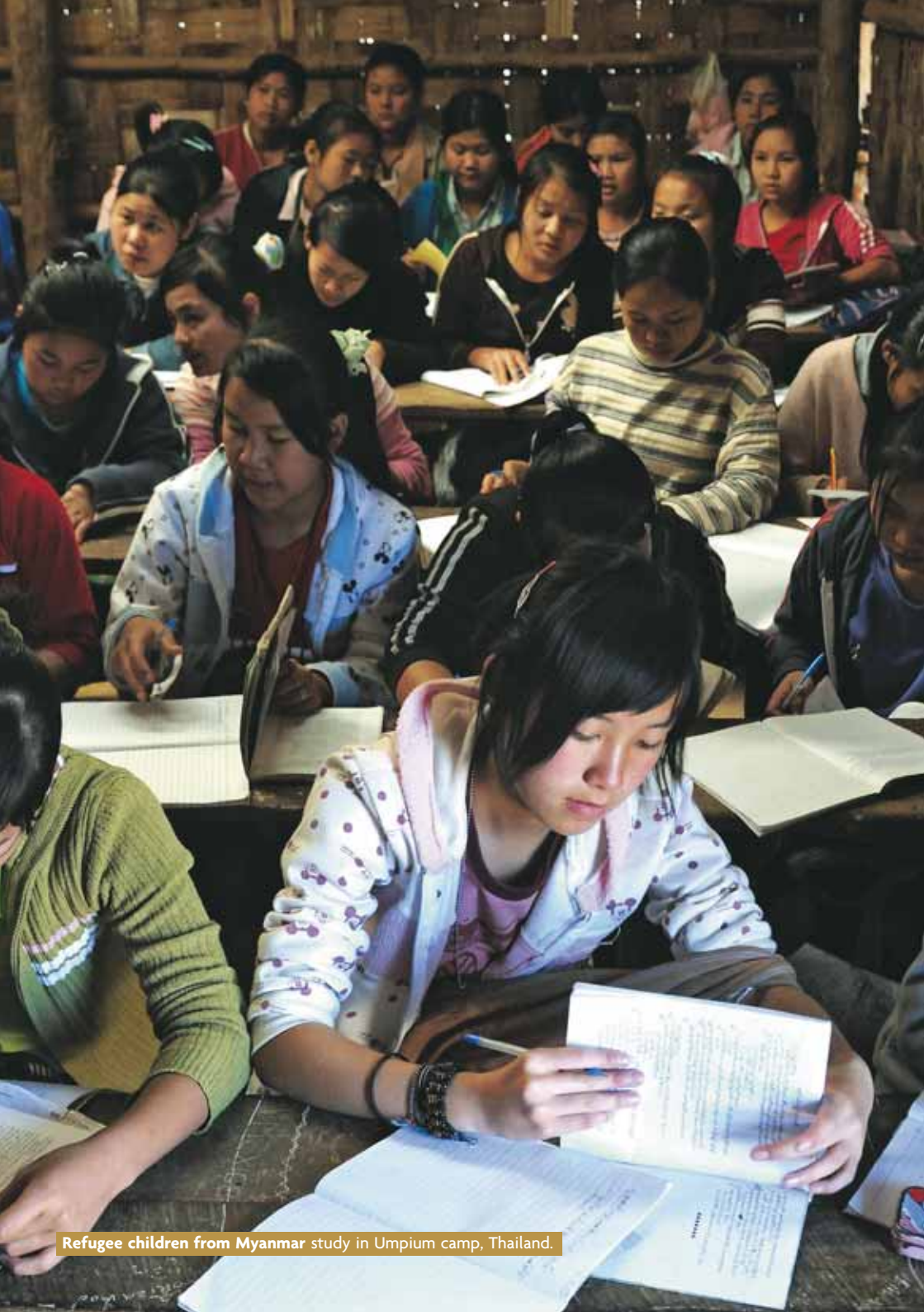
Refugee children from Myanmar study in Umpium camp, Thailand.