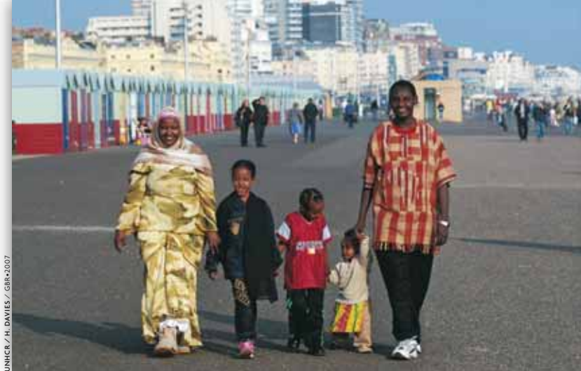
An Ethiopian refugee family visits the coastal resort of Brighton in the United Kingdom. They have been resettled in the UK after living for many years as refugees in Kenya.

Only a small number of nations take part in UNHCR resettlement programmes and accept quotas of refugees on an annual basis. In 2007, for example, 49,868 people were resettled in 25 countries. The number of refugees submitted by UNHCR to resettlement countries increased by 83 per cent compared to 2006 (54,182 submissions), with 98,999 submissions in 2007. For the first time in 20 years, UNHCR submissions exceeded the global capacity of resettlement countries (about 70,000 people).