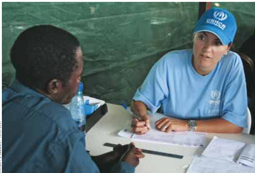
A UNHCR staff registers an Angolan refugee in neighbouring Namibia.

Governments bear the prime responsibility for protecting refugees on their territory, and often do so in concert with local non-governmental organizations (NGOs). However, in many countries, UNHCR staff also work alongside NGOs and other partners in a variety of locations ranging from capital cities to remote camps and border areas. They attempt to promote or provide legal and physical protection, and minimize the threat of violence – including sexual assault – which many refugees are subject to, even in countries of asylum.