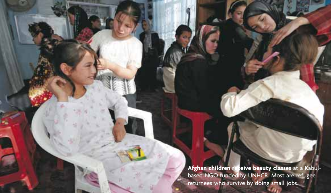
Afghan children receive beauty classes at a Kabul-based NGO funded by UNHCR. Most are refugee returnees who survive by doing small jobs.