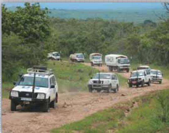
A UNHCR convoy carries South Sudanese refugees back home from northern Uganda.

The 1951 Convention does not specifically address the issue of civilians fleeing conflict, unless they fall within a particular group being persecuted within the context of the conflict. However, UNHCR's long-held position is that people fleeing conflicts should be more generally considered refugees, if their own state is unwilling or unable to protect them. Regional instruments, such as the 1969 Organization of African Unity Convention on refugees and the Cartagena Declaration in Latin America, explicitly support this stance.