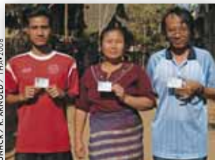
Refugees from Myanmar proudly show their ID cards at a camp in Thailand.

G OVERNMENTS NORMALLY GUARANTEE THE BASIC HUMAN RIGHTS and physical security of their citizens. But when civilians become refugees this safety net disappears. Without some sort of legal status in their asylum country, they would be exceptionally vulnerable to exploitation and other forms of ill treatment, as well as to imprisonment or deportation.