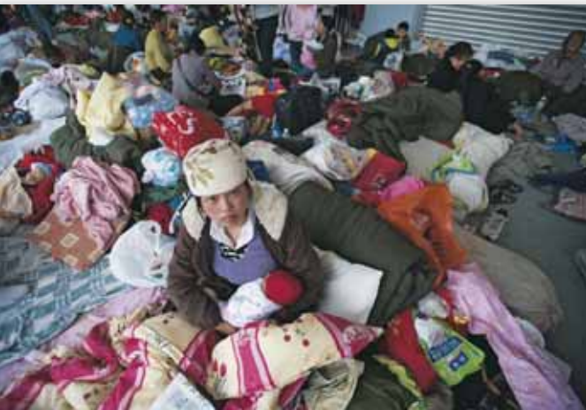
UNHCR / N. BEIRING / CHN2008

the world's longest-ever airlift as part of its operation to assist besieged populations, as well as displaced ones, in Bosnia and Herzegovina. More recently – although it is not normally involved in natural disaster relief – UNHCR launched major operations after the 2004 Indian Ocean tsunami and the 2005 Pakistan earthquake because in both cases shelter and camp management, UNHCR's two