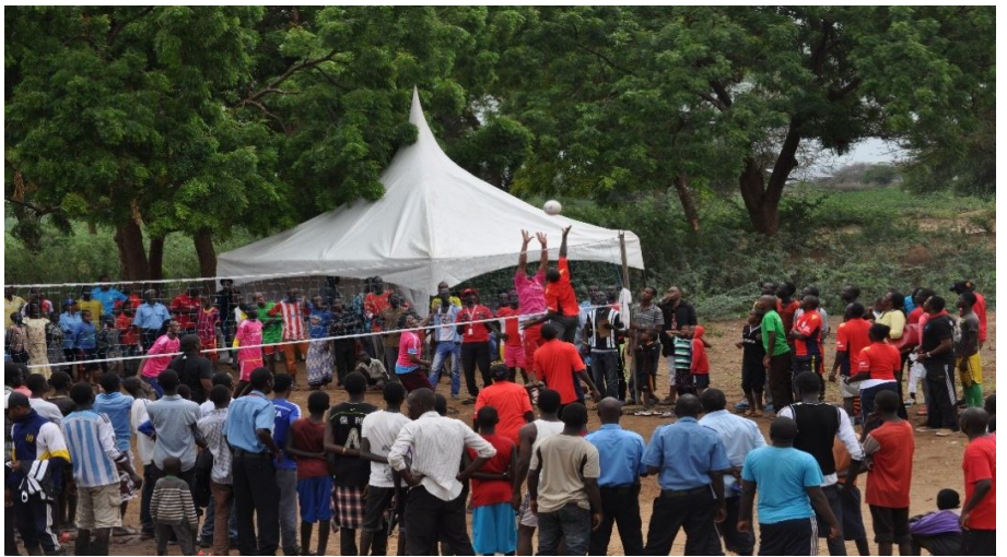
A volleyball game pitting agencies (in red) & refugees (in pink) as part of Olympic Games.

* In June, UNHCR Kakuma inactivated individuals who have not collected food rations or accessed other protection assistance since January 2016. As a result, the population figures decreased by 35,295 at the end of June. The current population figures reflect this decrease. UNHCR Kakuma will carry out a verification exercise in the near future to confirm the population of the camp and will report the updated figures.