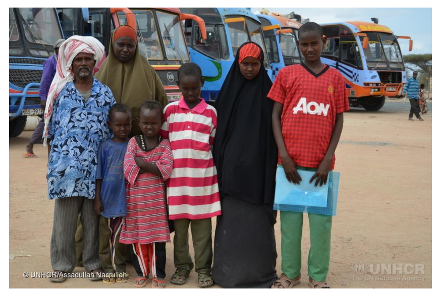
A refugee family from Dadaab camps ready to board buses to be transported to Somalia under the voluntary repatriation program.