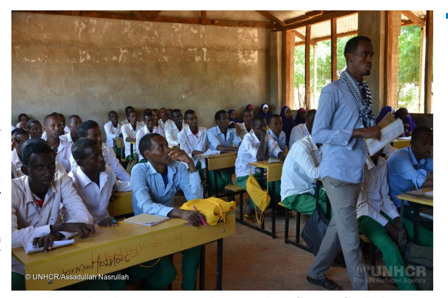
Students in their classroom at Hurmod Primary School, Ifo camp of Dadaab, Kenya.

UNHCR in collaboration with partners held an Annual Education Day in Dadaab on 13th and 14th July with the aim of rewarding academic performance students. among occasion was also a highlight for rewarding the best teachers and support staff. On 14th July, UNHCR staff joined Islamic Relief Kenya (IRK) staff to discuss issues of mutual importance between Parent and Teacher Association representatives and minority community leaders to enhance and access to school from disenfranchised students communities.