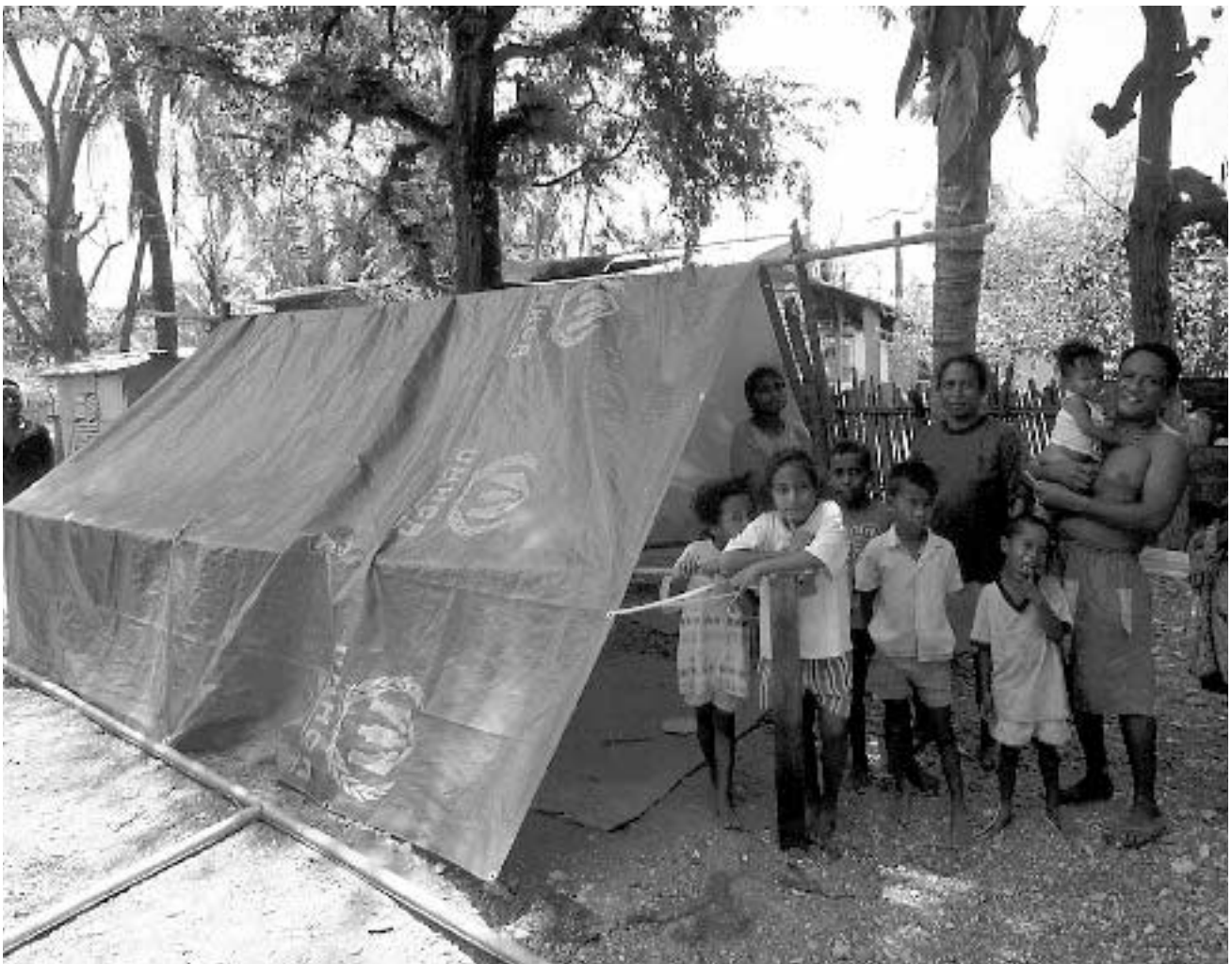
Refugees from East Timor in front of their temporary shelter.

Due to the continued UN designation of West Timor as a high security risk, UNHCR's interventions in 2002 to support voluntary repatriation and local settlement were restricted to time-limited ad hoc missions. Each ad hoc mission has required security clearance from UNSECOORD in New York. Regular UN access to West Timor in 2003 remains contingent on a lowered security phase. In Aceh and West Papua, ongoing security concerns limited the scope of the Police Training Project. Indonesian authorities requested that training activities be undertaken in safer, more stable areas. The Special Fund which was to facilitate the return of East Timorese civil servants, through the payment of their pensions, was delayed due to a lack of support from donors. Implementation of a local integration project for East Timorese refugees outside of West Timor was also delayed due to the priority attached by the Indonesian Government to