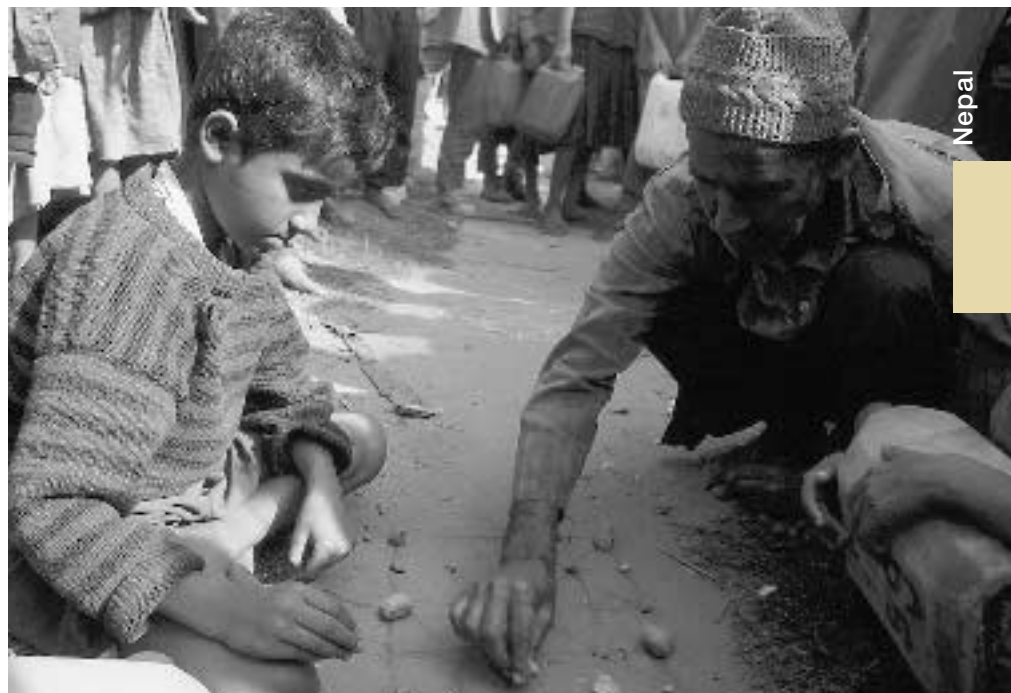
Refugees from Bhutan often play traditional games.

UNHCR will continue to provide kerosene for cooking purposes and to reduce environmental degradation. Refugee shelters and essential health facilities will be rehabilitated as required. Refugees will continue to be actively involved in the provision of health services and the rehabilitation of shelter and camp facilities. Extremely vulnerable refugees, including the elderly, the physically disabled and