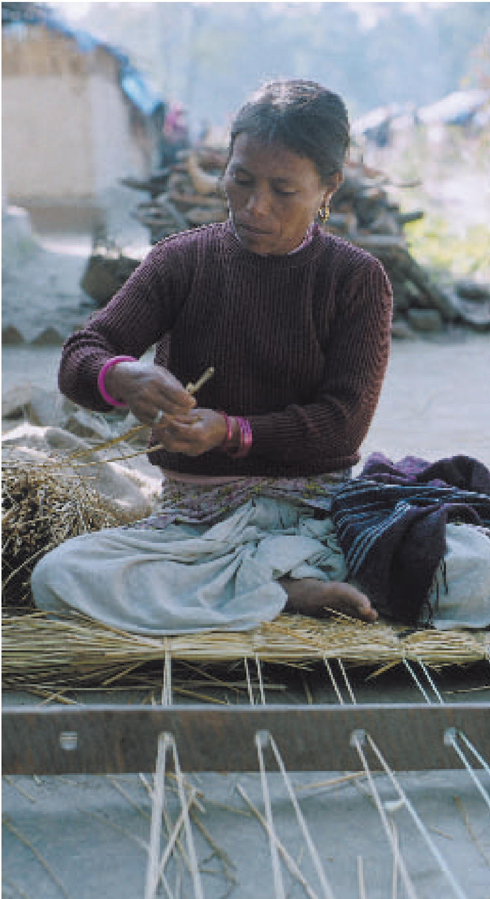
A Bhutanese refugee in Jhapa District undertaking an income-generating activity.

be provided to all populations. The overall literacy and mortality rate of the camp population will be comparable to national averages.