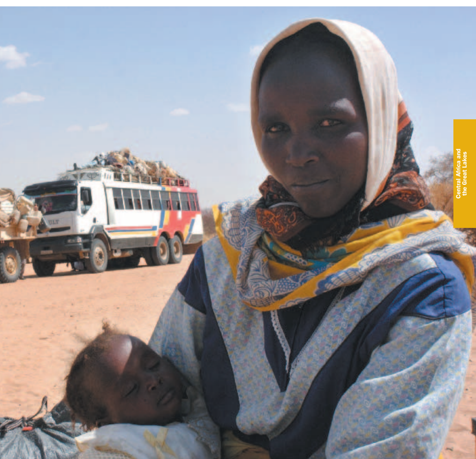
Chad: Refugees from Sudan - a refugee woman and her child as they get ready to join the convoy to the newly opened camp Oure Cassoni. Bahai, July 2004.