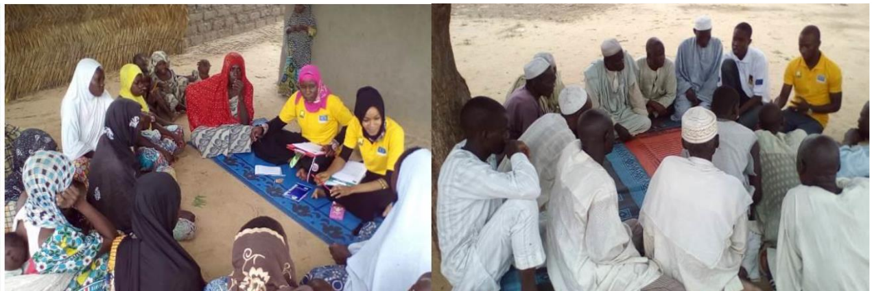
Female FGD Session at Yandadari community and Men FGD Session at Yandadari Community

IRC Food Security and Livelihoods Team Konduga LGA