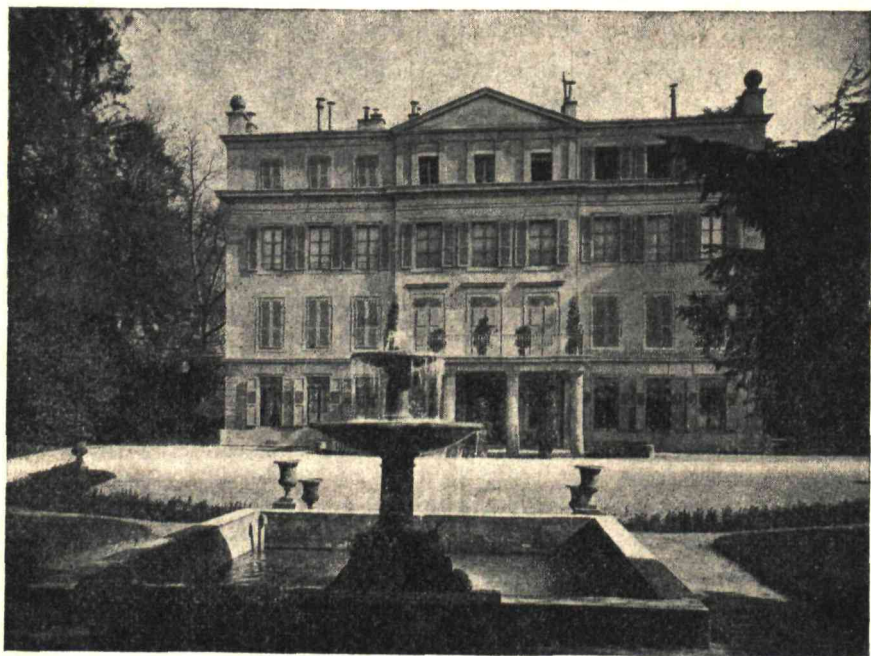
CAMPAGNE MON REPOS, LAUSANNE, HEADQUARTERS OF THE INTERNATIONAL OLYMPIC COMMITTEE.