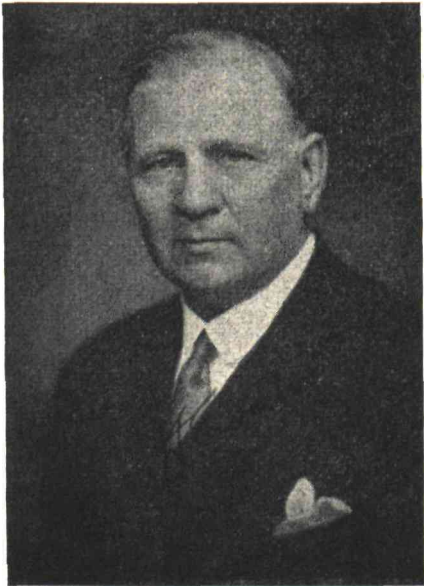
J. SIGFRID EDSTRÖM President 1946-1952.