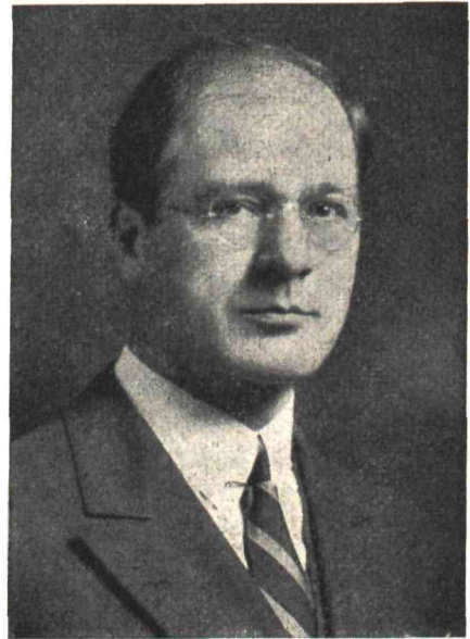
AVERY BRUNDAGE President 1952-