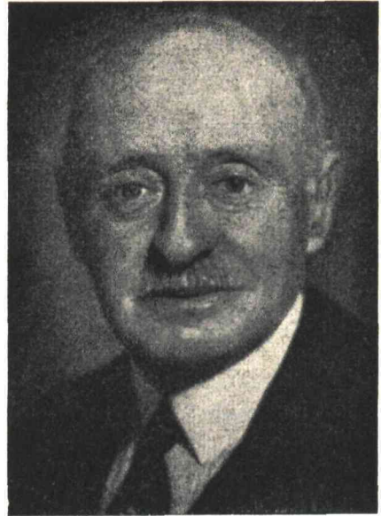
COMTE HENRI DE BAILLET-LATOURE President 1925-1941.