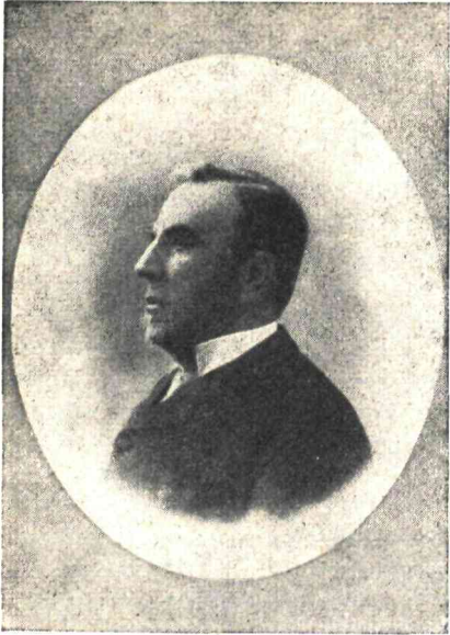
DEMETRIUS VIKELAS President 1894-1896.