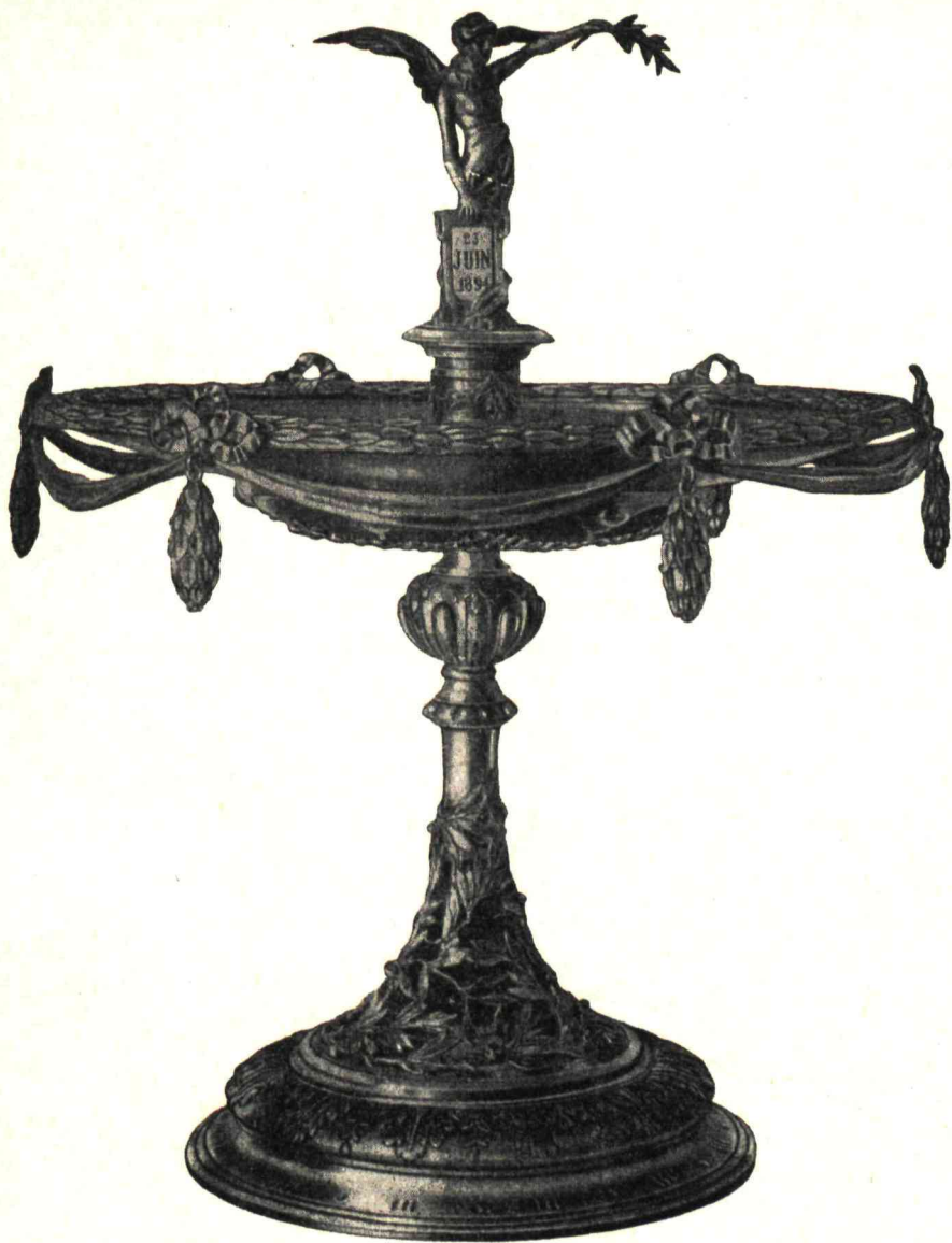
THE OLYMPIC CUP.