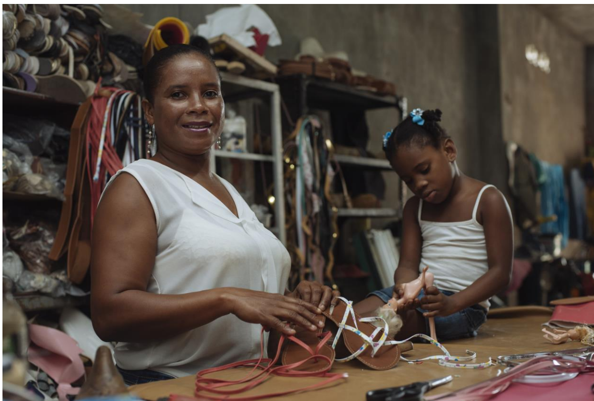
Colombian refugee making sandals in Ecuador.