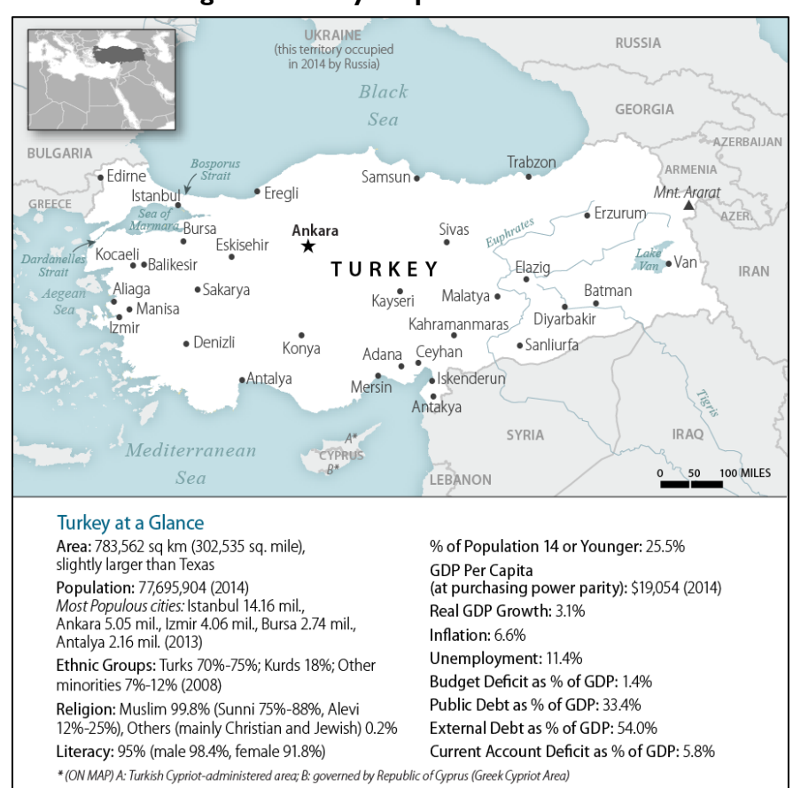
Figure 1. Turkey: Map and Basic Facts

Turkey's NATO membership and economic interdependence with Europe appear to have contributed to important Turkish decisions to rely on, and partner with, sources of Western strength. However, as Turkey has prospered, its economic success has taken place alongside efforts to seek greater overall self-reliance and independence in foreign policy.<sup>3</sup>