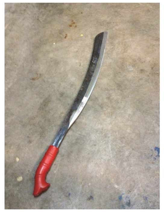
A parang (machete).

"self-protection . . . if police are threatened with death [and] there is no time to use a less lethal weapon." Yet cases examined by Human Rights Watch show that police shot at suspects when police use of force was not warranted and strongly suggest that the police are not adequately trained to use less-than-lethal force when facing threats to themselves or to public safety.