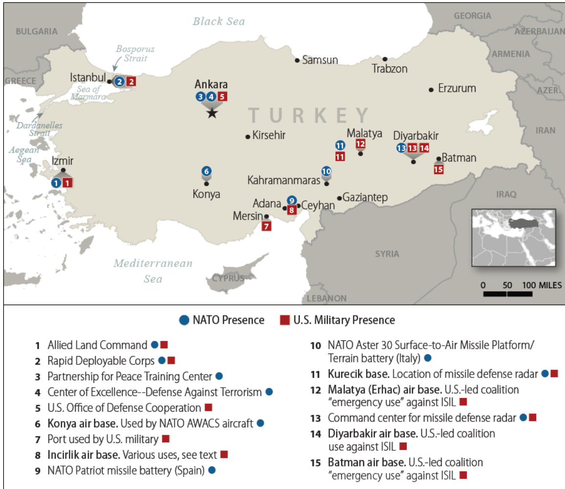
Figure 2. Map of U.S. and NATO Military Presence in Turkey