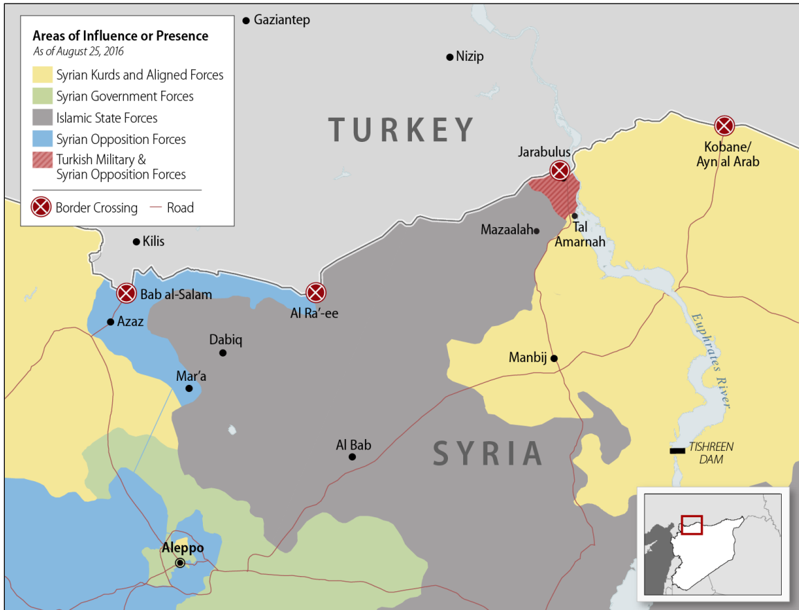
Figure 3. Northern Syria: Areas of Control