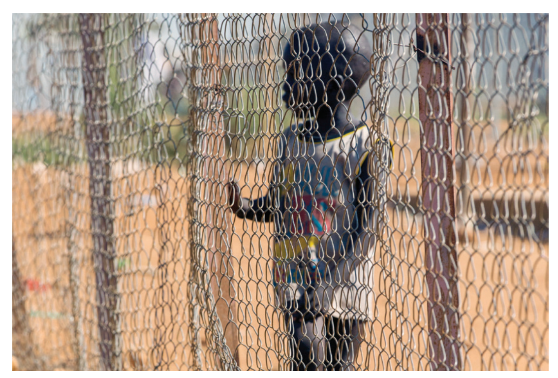
A child at the UNMISS PoC in Juba. 2015

"I am unable to sleep. My wife appears in my dreams. Sometimes she blames me for not performing the required funeral rites...I didn't go to church; I blamed God. When I would go to church I would just cry. My wife used to sing in church. I would remember her voice, how she used to sing."