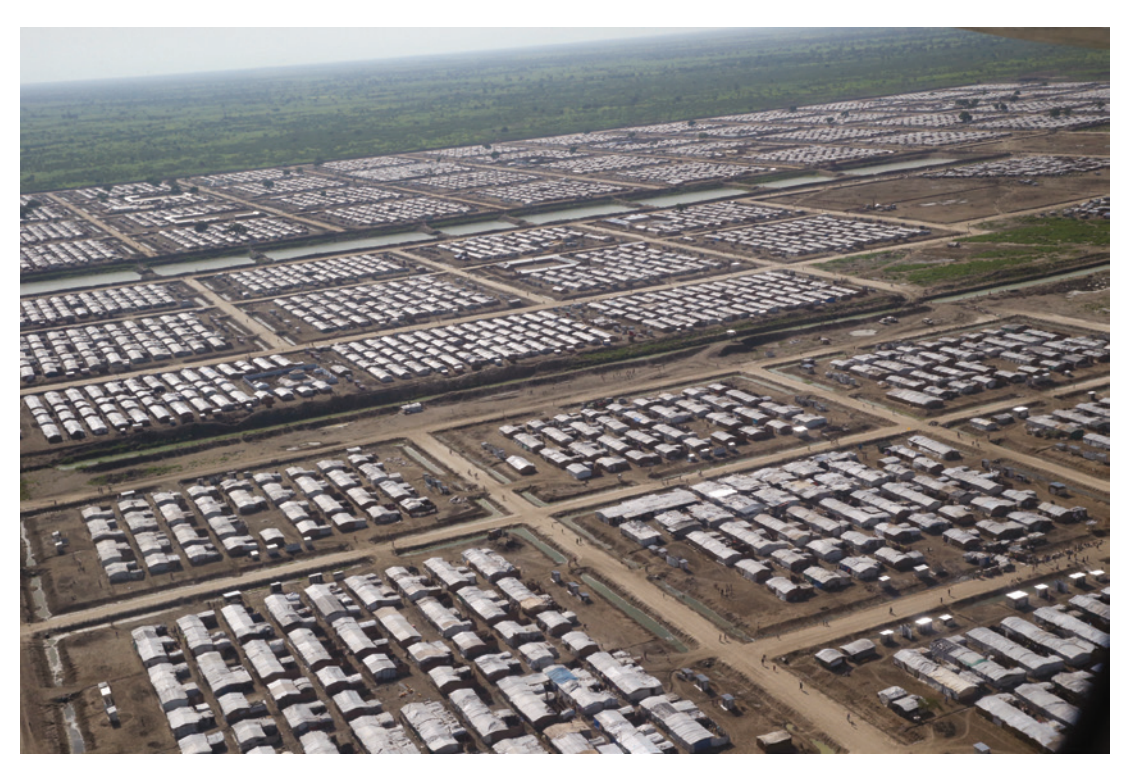
Aerial view of the UNMISS PoC site in Bentiu. June 2016.

Nyawal sought refuge in the Bentiu PoC site in early 2015, escaping an attack on her village in Guit county. She was raped by an SPLA soldier a few months after arriving at the PoC site when she ventured out to buy medicine.