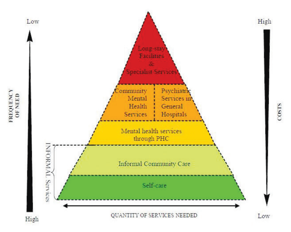
WHO optimal mix of services pyramid framework. 158

The Inter-Agency Steering Committee (IASC) guidelines on the provision of mental health and psychosocial support in emergency settings, such as the UNMISS PoC sites, recommend the availability of a similar, layered system of complementary supports to meet the needs of different groups. <sup>159</sup> (See figure 2) The IASC pyramid framework calls firstly for basic needs, such as food, shelter, and water to be provided in a socially appropriate manner that promotes mental health and psychosocial wellbeing. The second layer represents responses that seek to strengthen community and family supports, through for example, discussion groups, child-friendly spaces, and cultural and recreational activities. The third layer represents supports necessary for a smaller number of people who require additional, more focused individual or family interventions by trained and supervised workers. This layer includes basic mental health care by primary health care workers. The top layer represents the additional psychological or psychiatric supports needed for people whose suffering is intolerable and who have difficulties with basic daily functioning that exceed the capacity of any primary health services available. Though such specialised services are needed only for a small percentage of the population, according to the IASC, in most large emergencies this amounts to thousands of individuals. <sup>160</sup>