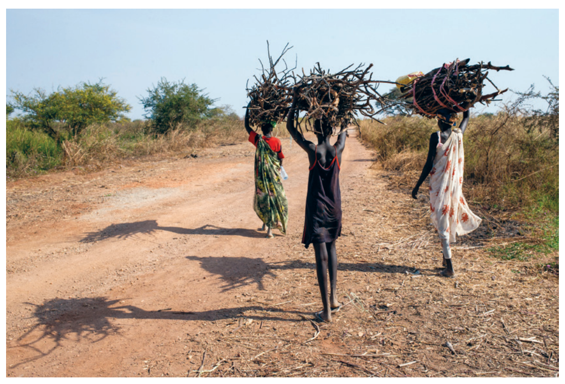
Women returning with collected firewood to the UNMISS PoC site in Bentiu, January 2015.

Nyawal was treated for her rape by Médecins Sans Frontières (MSF) and also received support from the International Rescue Committee (IRC), which provides counselling for survivors of sexual violence in the Bentiu PoC. Her experience caused her significant mental anguish.