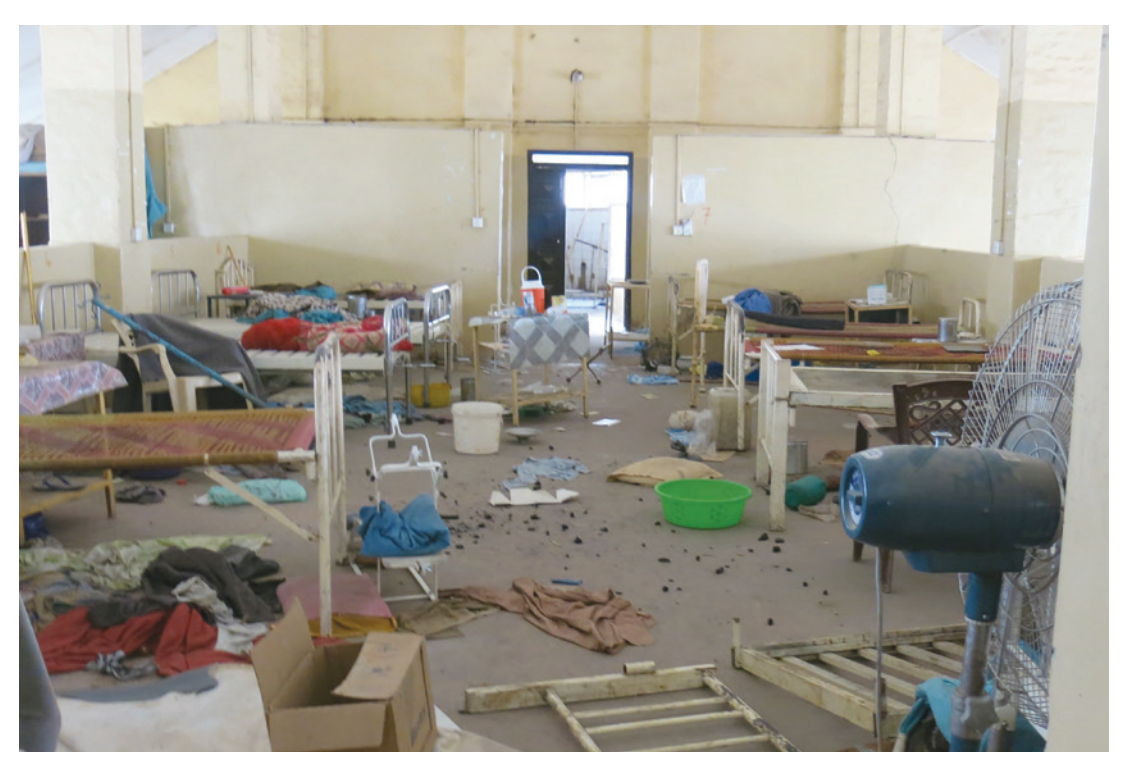
A ward in Malakal Teaching Hospital, where patients and displaced people who had taken refuge were killed by opposition forces in late February 2014. Malakal, Upper Nile state, March 2014.

"She can't manage—she's not normal. She can talk but it's senseless. She quarrels with the children. She cooks, but like a child, she burns things. She knows the children's names, but she does not know their ages. It is the children who tell her to do the things she should do. She can't identify what is happening...Sometimes I pray to God to help her." 51