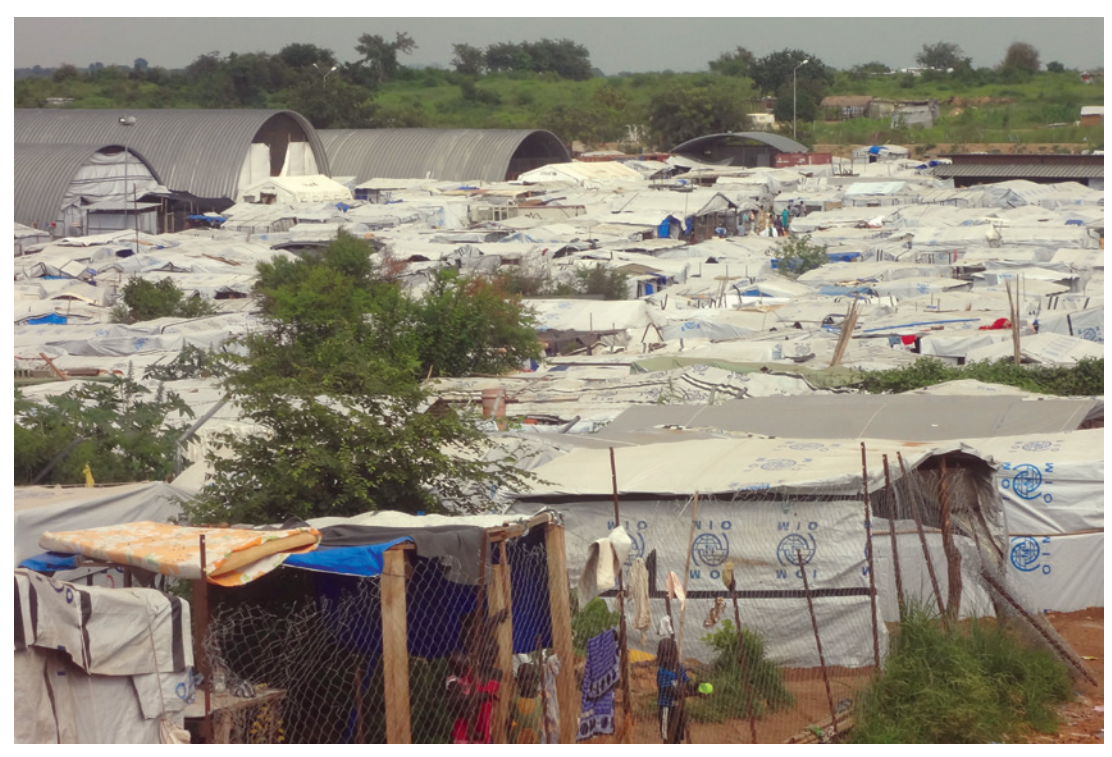
UNMISS PoC site in Juba, South Sudan. 2014 @ Amnesty International

I tried to go to school here but found that I could not concentrate even on the easy things. They just opened a school here, but my thoughts distract me. When I sit still, my mind just goes to other things like my children."