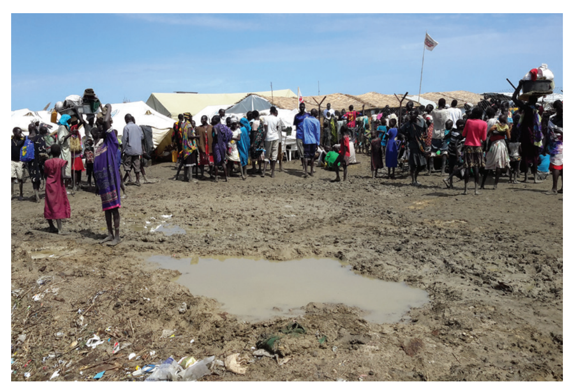
Newly arrived internally displaced people register at UNMISS PoC site in Bentiu, Unity state, May 2015.