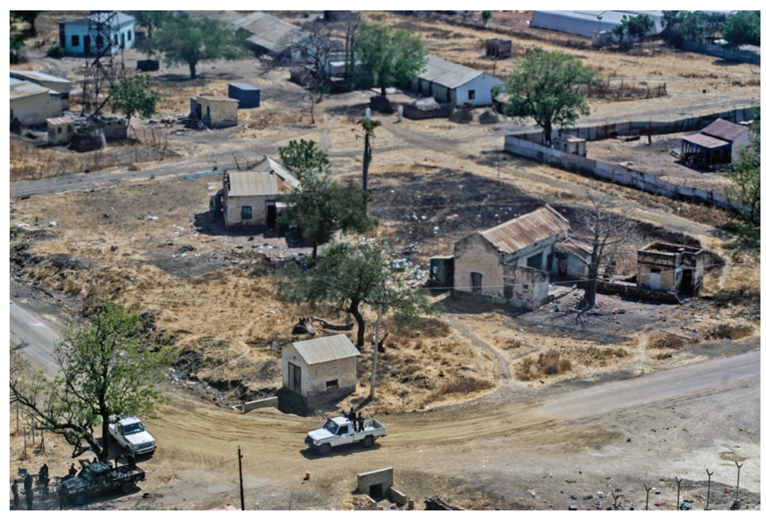
A view of the deserted streets in Malakal, Upper Nile state in January 2014 after residents fled violence between government and opposition forces.

Ajak fled to the Malakal UNMISS base on 25 December 2013, during the first attack on Malakal by opposition forces.