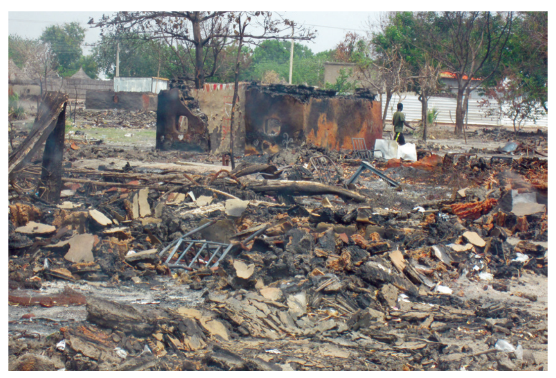
The conflict resulted in the destruction of homes, hospitals, and other buildings. Bentiu, South Sudan, March 2014.

In December 2013, growing political tension between President Salva Kiir and Dr Riek Machar mushroomed into a brutal internal armed conflict.<sup>4</sup> Fighting started in Juba, the capital, where government forces engaged in targeted killings, primarily of Nuer men. Security forces across the country split—with some maintaining allegiance to the government and others defecting to support the armed opposition under Machar, which came to be known as the Sudan People's Liberation Movement/ Army-In Opposition (SPLM/A-IO). By the end of 2013, the conflict had engulfed parts of Jonglei, Unity, and Upper Nile states.<sup>5</sup>