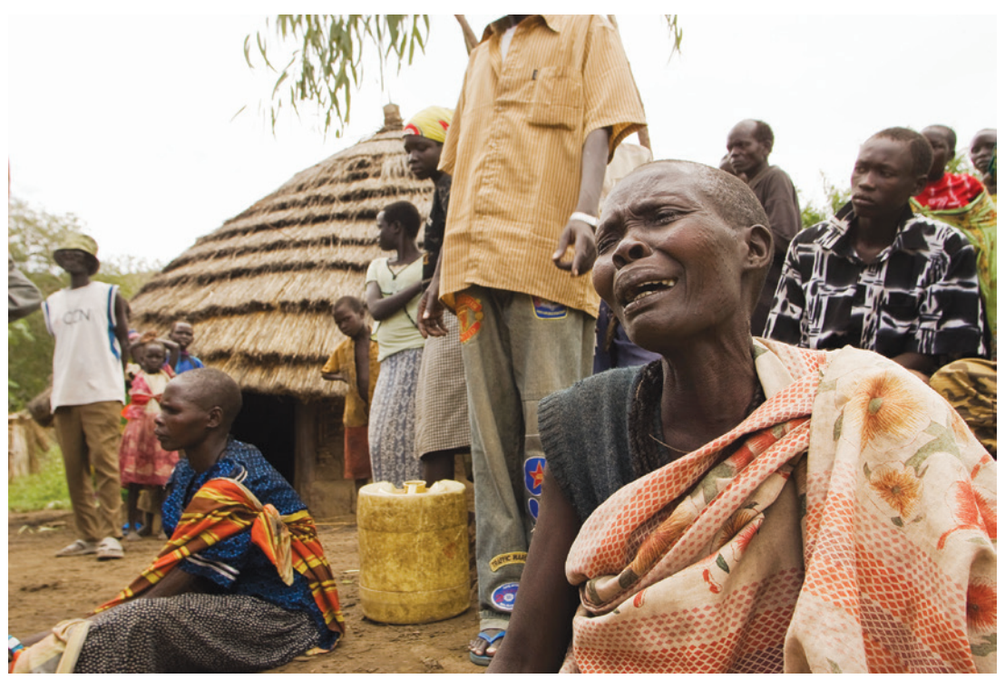
A woman cries following a deadly attack by cattle raiders. Chukudum, Eastern Equatoria state, 2007

The armed conflict that erupted in December 2013 is only the most recent episode of violence in South Sudan's history. From 1956 to 1972 and again from 1983 to 2005, the Government of Sudan and pro-government militias fought against armed groups who sought greater equality and autonomy for the southern regions of Sudan. Both periods of civil war were characterised by extreme violence against civilians, gross human rights abuses, and massive forced displacement. During the second civil war from 1983 to 2005, an estimated 1.9 million people—one out of every five southern Sudanese—were killed or died from disease and famine, and some four million people were internally displaced.<sup>2</sup>