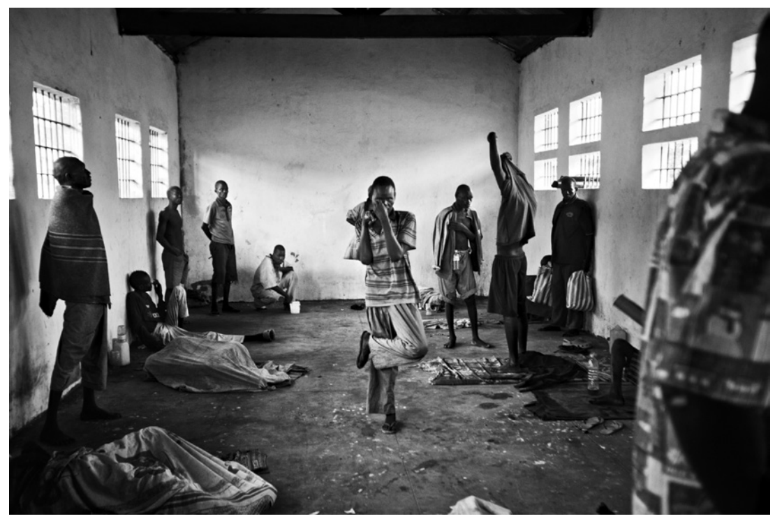
People with suspected mental conditions are routinely detained in prisons. Juba Central Prison, Juba, South Sudan, 2011.

The routine use of prisons to house individuals with mental health conditions is a stark manifestation of the inadequacy of mental health treatment, stigma about mental disorders and the deficit of facilities and trained staff. Individuals with mental health conditions deemed to pose a danger to themselves or others often end up arbitrarily detained in prison, even if they have not committed any crime. They may be transferred to prison from medical facilities or taken directly to prison by family members who feel unable to care for them. In May 2016, there were 66 male and 16 female inmates in Juba Central Prison categorized as mentally ill, more than half of whom had no criminal files.<sup>92</sup> According to a former health worker at Malakal Hospital, prior to the conflict, there were 27 people with mental health problems in the Malakal prison. "Some were brought to prison by family members because they were violent, aggressive, and suicidal," he explained.<sup>93</sup>