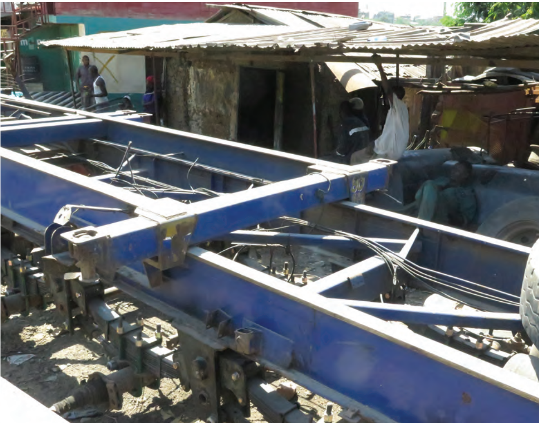
Left: Houses, workshops and other buildings had been marked with yellow crosses in preparation for highway expansion. The marked structures are located on 'road reserves' or public land that is designated for road construction.