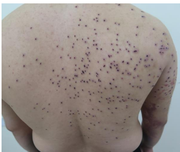
Birdshot injuries sustained by a protester shown to Amnesty International researchers in Bahrain in January 2015.

Amnesty International fully recognizes the Bahraini authorities’ duty to uphold the safety of the public and ensure public order, and that this task has become more challenging due to a rise in violence on the streets that has seen attacks on police officers and other members of the security forces, including a bomb attack at al-Daih village on 3 March 2014 that killed three police officers. At all times, however, when policing demonstrations, including those that the authorities consider illegal or that become violent, Bahraini law enforcement officers should comply with the standards that the international community has adopted to govern the use of force and firearms by law enforcement officials. These standards apply also to members of the armed forces or others when they are exercising powers normally exercised by the police. They are intended to ensure respect for the rights to life, liberty and security of the person, requiring that force may be used only when strictly necessary and then only to the extent required for the performance of their duty. According to the standards, firearms may be used only as a last resort – when strictly necessary to defend the user or others against an