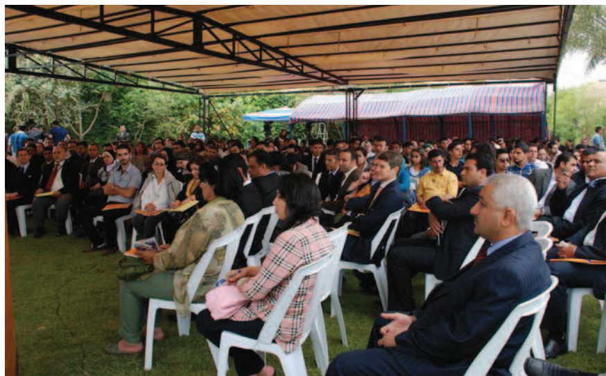
The conference brought government and civil society together to hear and in turn address the challenges the Iraqi youth faces today.

The Youth Conference served as an open consultative forum. Participants listened to young people’s personal accounts and collective experiences as well as their concerns, aspirations and proposals to address the many challenges lying ahead. The conference provided also a unique opportunity to discuss with relevant actors how to respond to these needs utilizing available instruments such as the Government National Development Plan, situational analysis and reports by UN agencies.