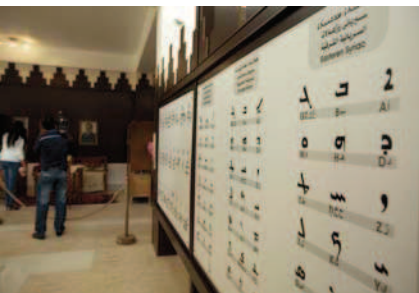
... as well as the historical breakdown of the Syriac alphabet to decipher them.