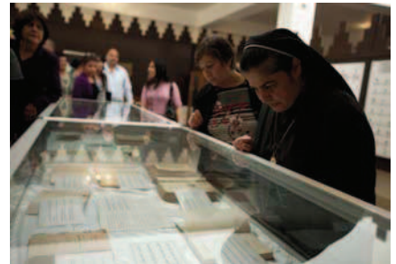
The manuscripts as well as old Syriac documents, originals in glass cabinets are on display...