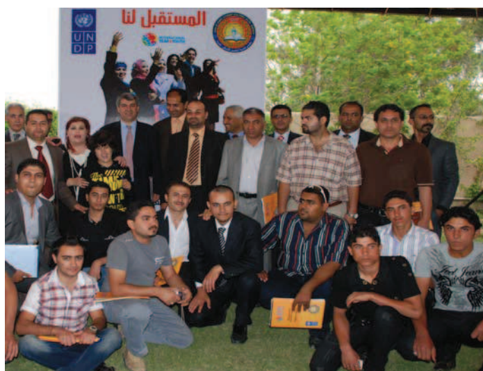
Participants in the Iraq Youth Conference gather for a group photo.

The situation in Iraq in the last years has been characterised by dynamic changes, with positive efforts towards reconciliation and economic recovery. However, significant challenges remain within development and social integration that cause deep uncertainty about the future of the country. As in many post-conflict contexts, one of the largest obstacles for recovery in Iraq is the lack of perspective regarding opportunities that the country can offer to its people. This is particularly true for the youth of Iraq who have been severely affected. Many have lost hope in the future and are frustrated by their limited potential to contribute to social and economic progress.