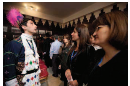
A moment of fun...