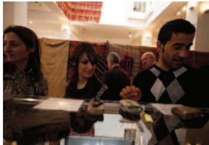
From old to new, historical to the mundane, not a detail goes unnoticed by visitors.