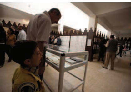
... and a moment of exhaustion.