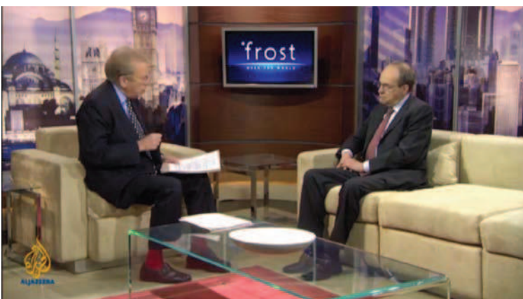
SRSg Ad Melkert appears live on Al-Jazeera's Frost Over the World show as a guest of Sir David Frost.

The Special Representative of the UN Secretary-General for Iraq (SRSg), Mr. Ad Melkert, was the guest of Sir David Frost in his Al-Jazeera International show, Frost Over the World on 15 April. The following is the full text of the interview on the overall situation in Iraq: