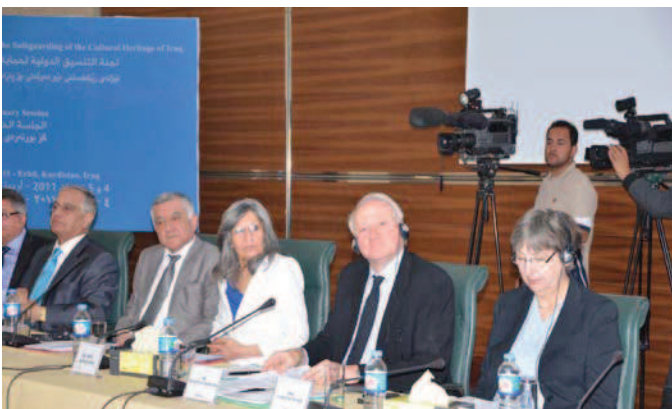
Opening of the Fifth plenary session of ICC Iraq, organized for the first time in Iraq.