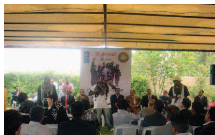
Young people from across Iraq making use of the conference opportunity to have their voice heard.

The National Youth Conference aimed to provide a platform for youth to share their voices and open discussion with relevant counterparts on priority issues addressed in the National Youth Strategy such as employment, access to services and participation in governance. It also aimed at initiating a consultation process on the Iraq National Human Development Report, which proposes to focus on “youth” issues as the key theme.