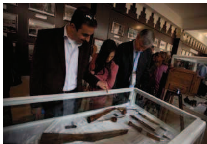
From weapons, to cameras, to toys for small children, every single item is a contribution by residents of Ankawa.