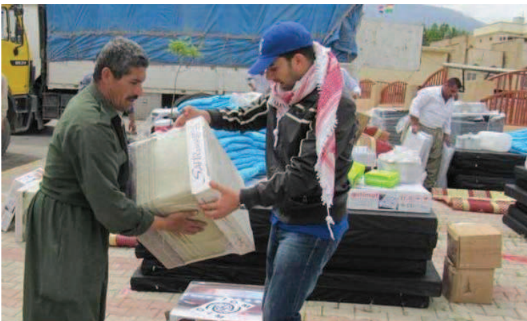
IOM aid reaches regions affected by flooding.

The severe storms that occurred in Northern and Central Iraq in mid-April caused massive flooding and damaged the homes of hundreds of families. The Rawanduz District and Warte sub-district of Erbil were particularly affected on Friday, April 22, with severe rainstorms flooding a large portion of the Erbil governorate.