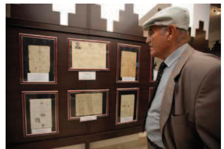
... and every document at the Syriac Heritage Museum tells part of the story of one of the most colorful cultures in the diverse cultural landscape of Iraq.