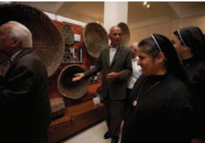
Not the smallest component of daily life in Ankawa goes unnoticed in the Museum, where even the simplest contributions are backed up by old photographs showing the artifacts customarily used in daily life.