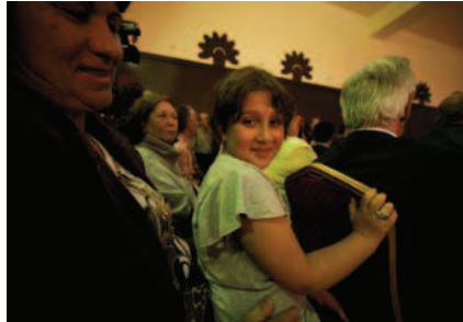
The small hall where the opening speeches are delivered by the director of the Museum as well as honorary guests is crowded with visitors.