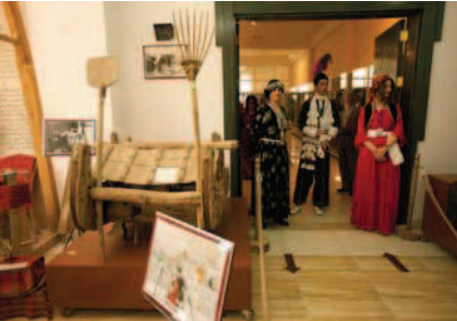
Preparing to receive the guests: The opening for the Syriac Heritage Museum in Ankawa, Erbil, is a momentous occasion for the local Christian community. Museum personnel in traditional dresses welcome the guests.

The April 10th inauguration of the Museum for Syriac Heritage in Ankawa town, Erbil, is the first of its kind in the Kurdistan Region of Iraq. The opening ceremony attracted not only the residents of this Christian neighborhood, but also some high level guests such as the Kurdistan Regional Government's Minister of Culture, Dr. Kawa Mahmoud, and the Archbishop of Ankawa, Mr. Bashar Mati Warda.