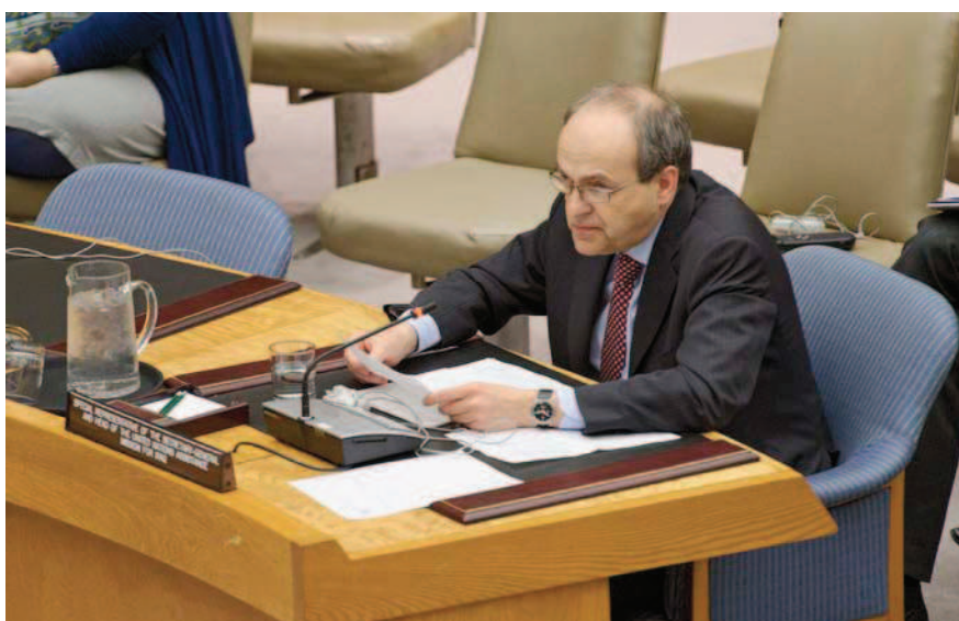
SRSG Ad Melkert briefs the Security Council on the work of UNAMI and on recent developments in Iraq.

Speaking to the UN Security Council on 8 April, Mr. Ad Melkert, the Special Representative of the UN Secretary-General (SRSG) for Iraq and the head of UNAMI, updated the Council members on the latest developments in Iraq.