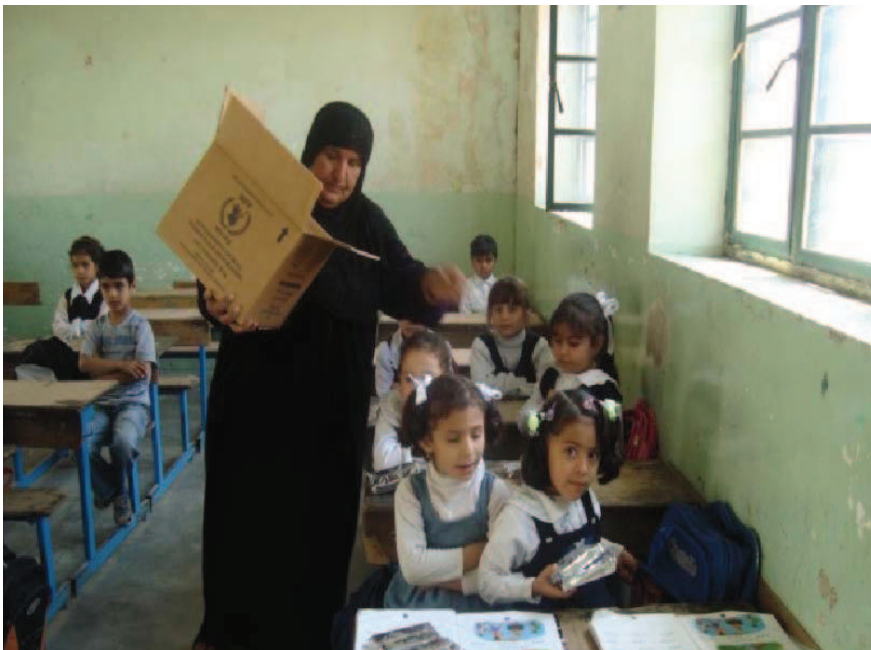
Distributing micronutrient biscuits to Iraqi children.

The World Food Programme (WFP) is supporting the Ministry of Education's National School Feeding programme which is designed to encourage children's access to education and to reduce drop-outs during primary educa-